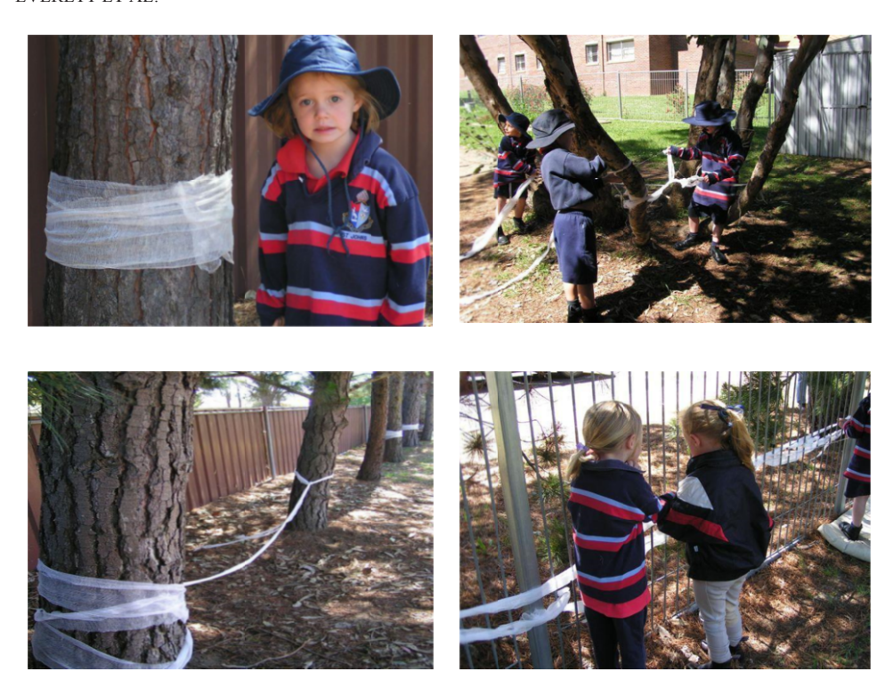
Figure 11.7. The children's installations in their schoolyard (McMillan, 2008).

Learning Sequence 2: Responding to place through musical composition (Ros Littledyke)