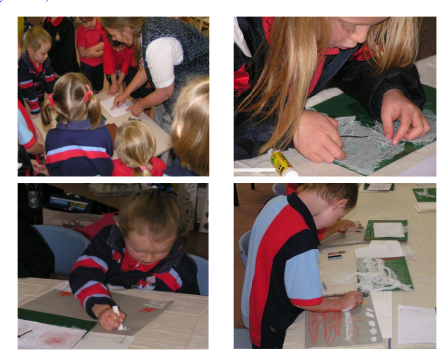
Figure 11.5. Developing media fluency (McMillan, 2008).

was uncluttered and focused. We displayed drawings and photos of the installation and reviewed and discussed them with the children, so helping them remember and refocus after their visit to the art museum. Once Christine had demonstrated possibilities for the art materials provided, we tried to replicate explorative studio processes with the children (Figure 11.5).