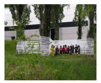
Figure 11.4. Children exploring the installation (McMillan, 2008).

Developing fluency with the media Christine, the teacher and I spent much time preparing the classroom environment and art materials, and sequencing and timing the experiences that would enable the children to create their own installations in the playground. The classroom