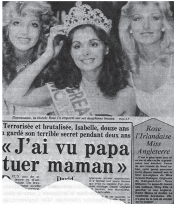
Fig. 19.1 News photograph from France Soir , taken from Lambert (1986, p. 44)

Another idea of Barthes's, which emerges in the second article (Barthes 1982, p. 30 f.), should be noted here: the idea that no picture contains information in itself or, alternatively, that it contains so much contradictory information that a verbal message is needed to fix its meaning (cf. Sonesson 1989a, p. 114 ff.). It has been suggested by Schaeffer (1987, p. 99) that it was because of his having mainly studied strongly organized communicational contexts, such as advertisements and press photographs, that Barthes became convinced of the leading part played by verbal language even in the understanding of pictures; but neither art photography nor scientific photographs would seem to be determined linguistically to a comparable extent, though their interpretation certainly require them to be inserted into some more general background frame, that it to say, assimilated to a selected set of interpretational schemes defined by the particular lifeworld (cf. Sonesson 1989a) 2 ; but there is no need for these to be of a linguistic nature.