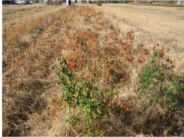
Fig. 3.7 Cold tolerant pepper