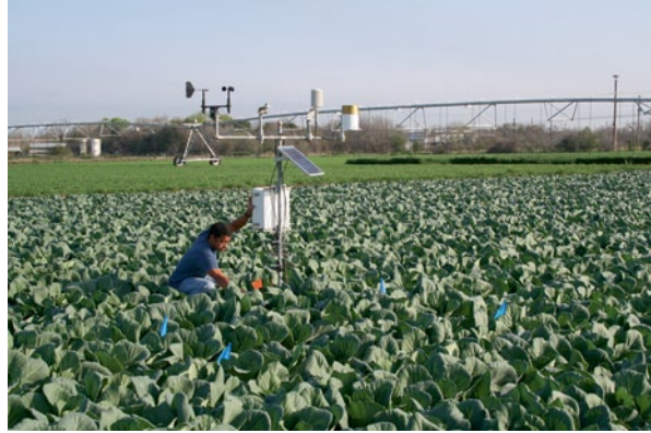
Fig. 3.6 Lysimeter and center pivot irrigation rig