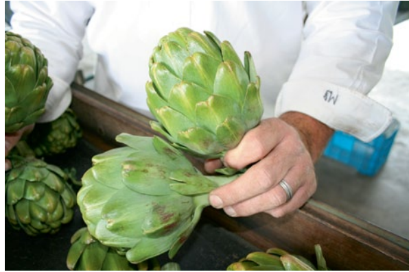
Fig. 3.8 High quality artichoke head