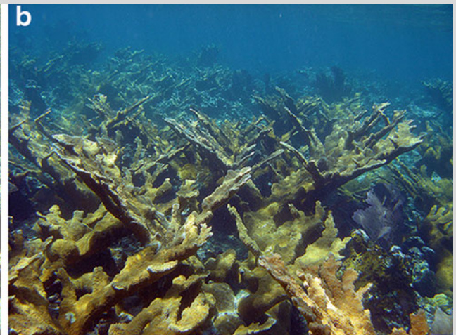
Fig. 12.3 Two A. palmata zones in St. John, US Virgin Islands: (a) Newfound Reef: Little live coral is present in this zone that was probably decimated by white band disease and storms. (b) Hawksnest Reef: A. palmata grows in high density here

sexual recruitment. Some A. palmata zones continue to have little to no A. palmata cover while others have high densities of the species (Fig. 12.3).