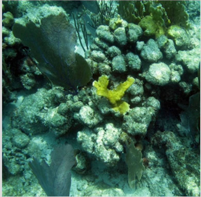
Fig. 12.2 An A. palmata colony growing on top of a dead Orbicella annularis colony