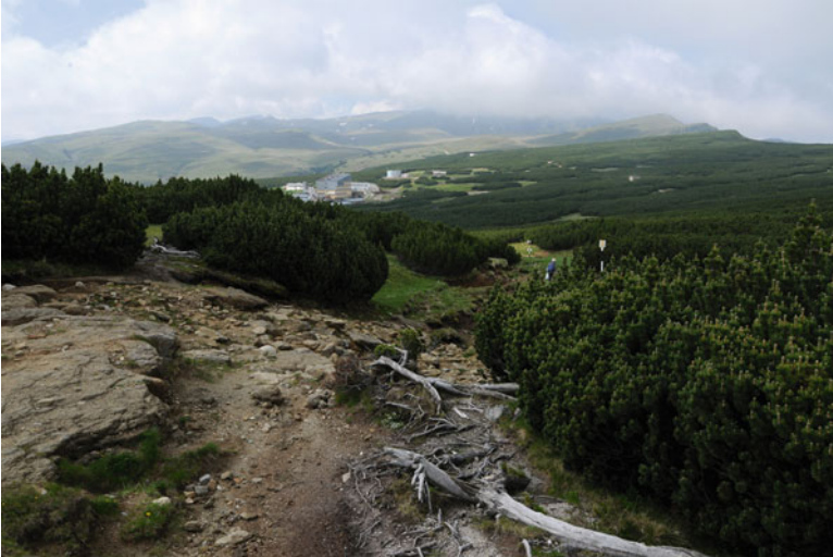
Fig. 4.5 Bushes with Pinus mugo and Rhododendron myrtifolium at the Bucegi mountains affected by erosion and fragmentation

Significant impacts with periodic variations are expected for temperate heaths and scrubs in alpine climate. Changes will occur in the temperature and precipitation regime, frost and snow days. Also, extreme events like torrents and storms associated with erosion, ruptures, and habitat fragmentation will occur more often. The expected cumulative effect could lead to the potential loss of plant species strongly depending on humidity and low temperature, as well as to degradation and potential loss of some types of habitats dominated by mesophytes or mesohygrophytes and psichrothermophytes, like bushlands with Pinus mugo Turra and Rhododendron myrtifolium Schott & Kotschy (Natura 2000 code: 4070, Fig. 4.5).