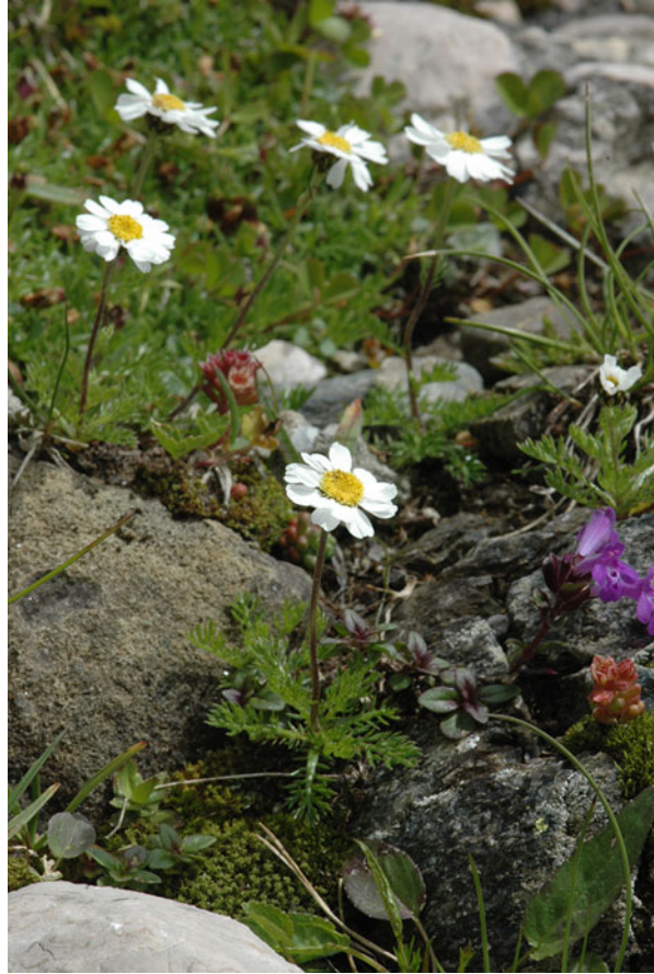
Fig. 4.8 Calcareous rocky slopes with chasmophytic vegetation (Natura 2000 code: 8210) with Achillea oxyloba subsp. schurii within Bucegi Natural Park (Photo: Anca Sârbu)

affected by changes in seasonality (Milad et al. 2011; Profft and Frischbier 2009), temperature increase, and changes in precipitation pattern. They are also sensitive to increased drought stress associated with fluctuation in frequency, amplitude and moment of a drought's appearance, and to changes in groundwater level and in flooding regime. Torrents, storms, and heavy rains can all be ranked as heavy impacts. Cumulative impacts could lead to the loss of relevant and sensitive species, changes in the structure of the forest community, drying out of forest areas, an increased advantage of the propagation of pests, and improved conditions for the development of alien plants. Monitoring data show a significant relation between warmer growing conditions and the distribution and abundance of pest insects, such as bark beetles on spruce or larch (e.g. Ips typographus Linné), as well as oak processionary ( Thaumetopoea processionea Linné) or horse chestnut leaf miner ( Cameraria ohridella Deschka and Dimic).