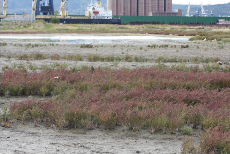
Fig. 4.2 Slovenian shallow coasts colonised with Salicornia sp. and other halophytes are frequently bordered with ports, urban areas, or infrastructure, with no possibilities to migrate in case of further sea-level rise

For standing water as well as for running water habitats, the most significant impacts are hydrological changes affecting water regime and water level.