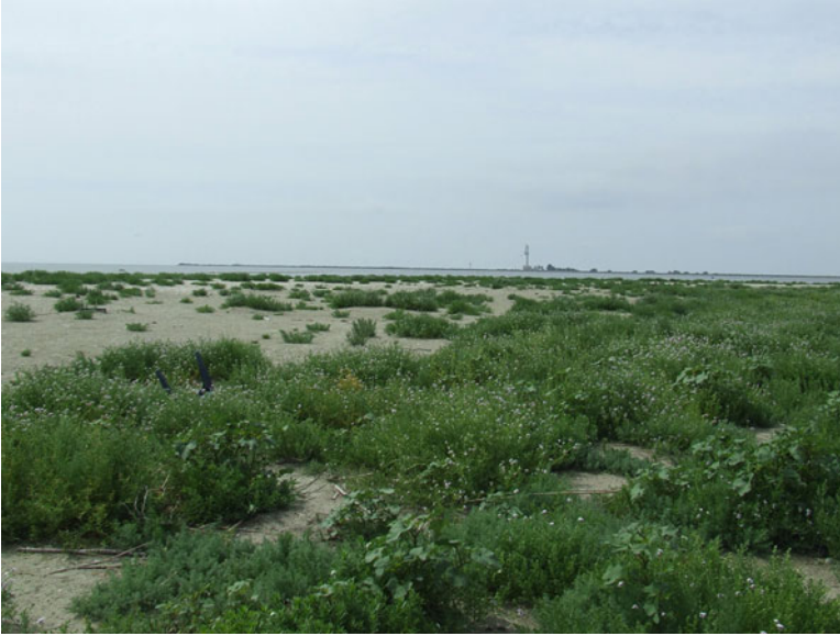
Fig. 4.1 Annual vegetation of drift lines viewed from the strictly protected area in the Danube Delta Biosphere reserve

Other significant examples can be found along the Slovenian seacoast of the Mediterranean Sea (Sečovlje Salina and Škocjan Inlet) where four different coastal wetland habitat types are affected by sea-level rise: rush salt marches dominated by Juncus maritimus Lam. and/or Juncus acutus L. (Natura 2000 code: 1410) (Kaligarič and Škornik 2007), Spartina sp. Schreb. swards (Natura 2000 code: 1320), Salicornia sp. L., and other annuals colonising mud and sand (Natura 2000 code: 1310, see Fig. 4.2) and Mediterranean and thermo-Atlantic halophilic scrub (Natura 2000 code: 1420).