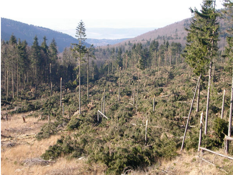
Fig. 4.9 Spruce forest ecosystem of the Thuringian Forest, Germany, damaged by storm “Kyrill” on January 17, 2007. In total, about 2.7 % of the forest area was damaged. According to the German Weather Service (Deutscher Wetterdienst, DWD), the likelihood of the occurrence of such an extreme weather event is every 10–20 years

affected by changes in temperature and precipitation pattern as well as in ground-water level. Heavy rains, storms, and torrents need to be considered as significant impacts for forest life as well. They can have a great impact on stand stability and can cause sudden and dramatic ecological and economic losses (Fig. 4.9).