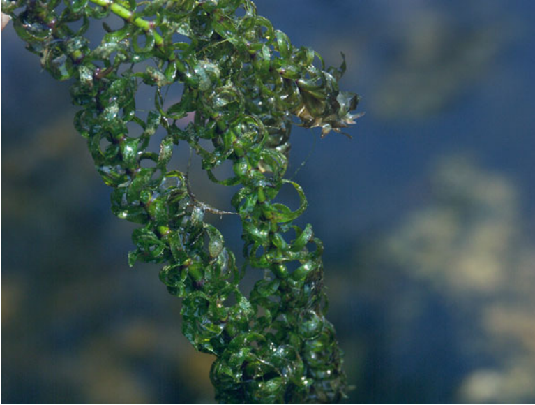
Fig. 4.3 Elodea nuttallii , Danube Delta Biosphere reserve, June 2005