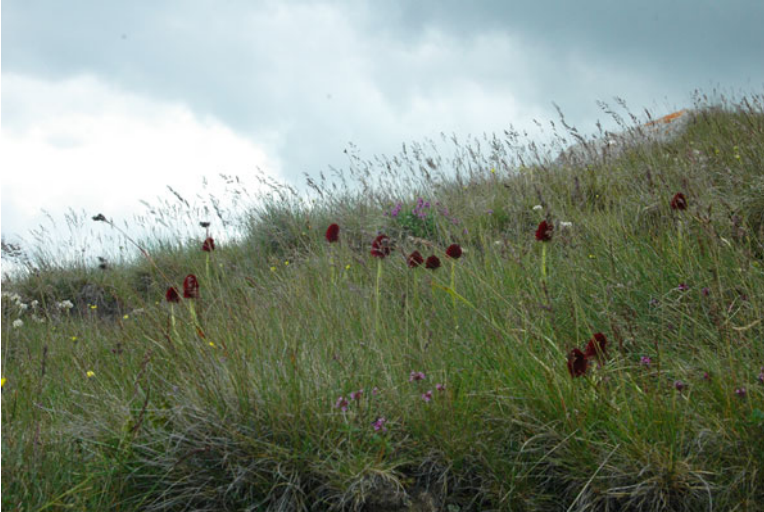
Fig. 4.6 Silicious alpine and boreal grasslands (Natura 2000 code: 6150) from Bucegi Natural Park; in front the rare and threatened plant Nigritella nigra

high temperature, and eutrophication, and will favour the expansion of drought tolerant ones, the increase of scrub abundance, and will modify succession sequences.