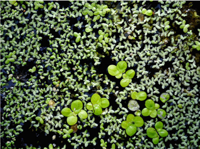
Fig. 4.4 Lemna minuta (the small one) and Lemna gibba L., Kis-Balaton area, Hungary