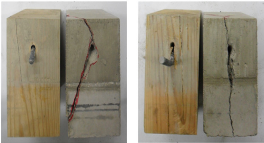
Fig. 6 Photographs after shear failure of wood-concrete composites ( left : 20 mm anchorage, right : 100mm anchorage)

Fig. 6 shows photographs after failure of tested wood-concrete composites at 20 mm and 100 mm of anchorage. After the yield load, local part around steel rebar at concrete part pulled out with steel rebar in the case of 20 mm of anchorage (fig. 7, left ). However, there was not pull out failure over 40 mm of anchorage and brittle failure of concrete occurred different from the wood-to-wood composite (Lee et. al. , 2012). Concrete cracked along the loading direction as confirmed from fig 7( right ). And bending of steel rebar also can be confirmed which indicates the plastic hinge at the shear plane.