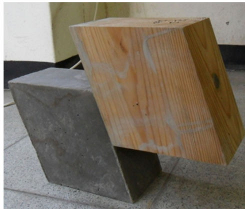
Fig. 1 Wood-concrete composite

2 \text{ m}^3 of ready-mixed concrete which was made by Korean standard (KSF 4009) was used for concrete material. Table 1 shows the mix properties of concrete which's design strength targeted to 21 MPa. The concrete was cured in shady place about 28 days and the compressive strength after the curing shows 20.1 MPa.