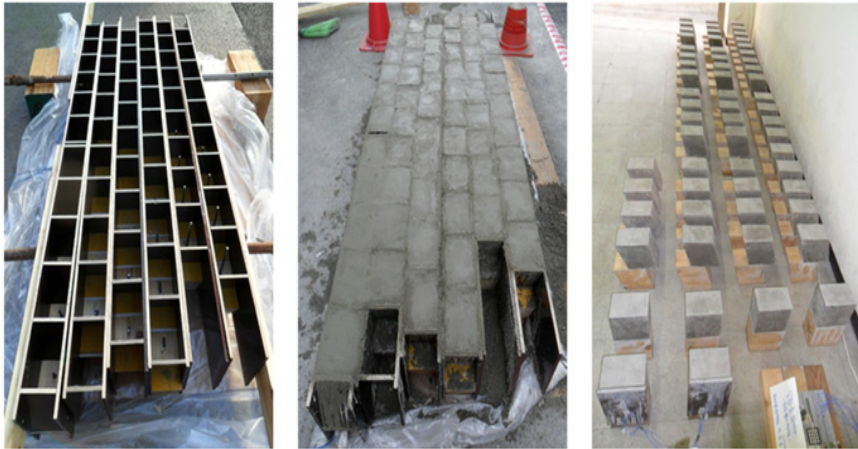
Fig. 2 Manufacturing process of making wood-concrete composite

After anchoring of steel rebar in wood with eight different length, form work for making concrete part was performed (fig. 2). FIS V 360S chemical anchor (Fischer co., ltd., Germany) was used for anchoring steel rebar in wood and form work was done after two days of curing the chemical anchor. Fig. 2 also shows the specimens after pouring ready-mixed concrete and concrete part was cured in shady place about three days. After removing the form, each specimens were additionally cured about twenty five days.