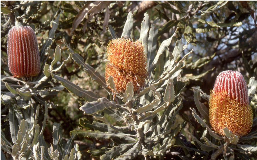
Photo 2.6 Banksia menziesii in Kwongan near Cataby, Western Australia. All but one Banksia species are endemic to Australia. Western Australia is the centre of the diversity of banksias