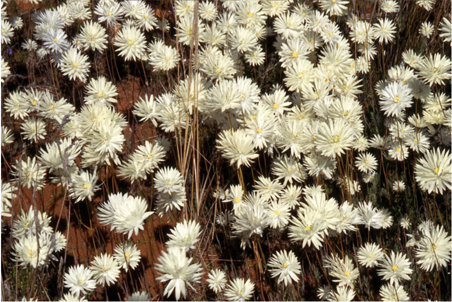
Photo 2.3 Helipterum splendens in a dense spring carpet community together with a few other annuals, near Cue, some 450 km NE of Perth. This plant is also commercially grown for gardening