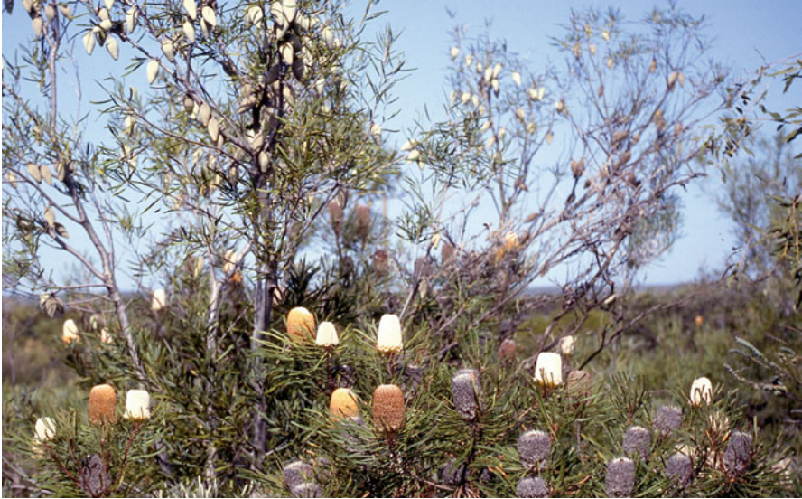
Photo 2.5 Banksia hookeriana and Xylomelum occidentale on sandplain shrubland near Enneaba, Western Australia. Both species belong to the Proteaceae; this family is very species-rich and mainly distributed in Australia, South Africa and southern South America