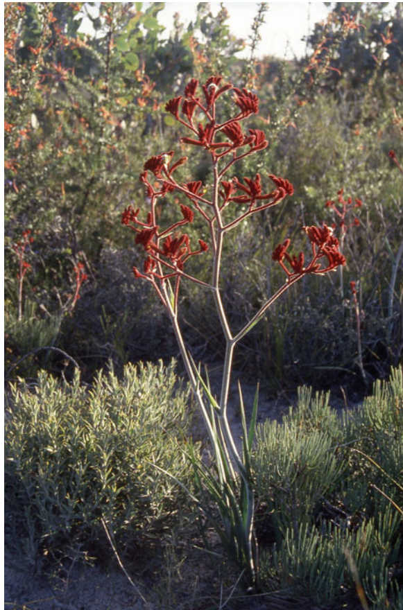
Photo 2.2 Anigozanthus rufus in species-rich kwongan (Fitzgerald River National Park, some 600 km SE of Perth, near the south coast of Australia; photographed by Marinus Werger). Kwongan is the general Australian term for Mediterranean type woody scrub vegetation. This perennial plant is endemic to dry sandy, silicious regions. The species and other members of the genus are grown commercially in many parts of the world