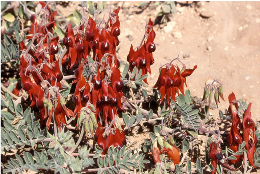
Photo 2.4 Swainsona formosa ( Cianthus formosus ) at Coral Bay, Western Australia. The annual plant species is native to the arid regions of central and north-western Australia