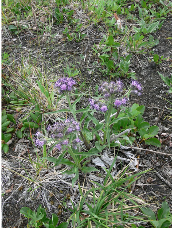
Photo 2.1 Saussurea pseudotilesii , endemic to Kamchatka Peninsula and Commander Islands in the Russian Far East, NE Asia, in pioneer vegetation on tephra (Photographed by Dietbert Thannheiser, Kamchatka Peninsula)

example of a geographically restricted species which occurs at different altitudes between sea level and up to c. 1,000 m, on different soil types and in different habitat types such as ruderal vegetation, coastal dunes, megaforb communities, or tundra is Saussurea pseudotilesii on Kamtchatka peninsula. We assume that the dispersal mode of hydrochory in the marine environment and ecological conditions promote the wide geographical distribution in the case of Rhizophora mangle whereas dispersal or pollination mode and/or the marine environment limits the ranges of Cirsium hypopsilum and Saussurea pseudotilesii (Photo 2.1).