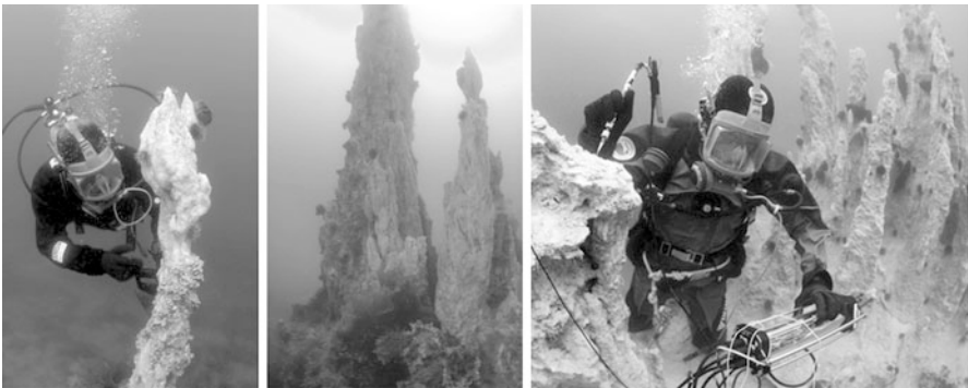
Figure 2. Sea urchins, sea anemones, coralline red algae, ascidians, mussels, and several other species inhabit the outside of the ikaite columns.

The organisms found on the ikaite columns are similar to organisms found on offshore fishing banks, wave beaten shores, and narrow channels, and the