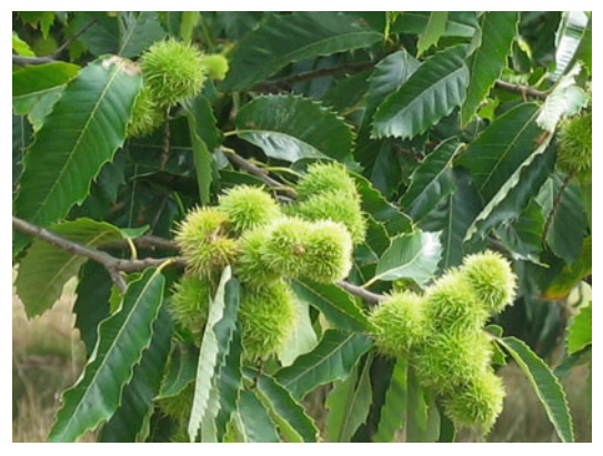
Plate 4 Spiny chestnut cupules