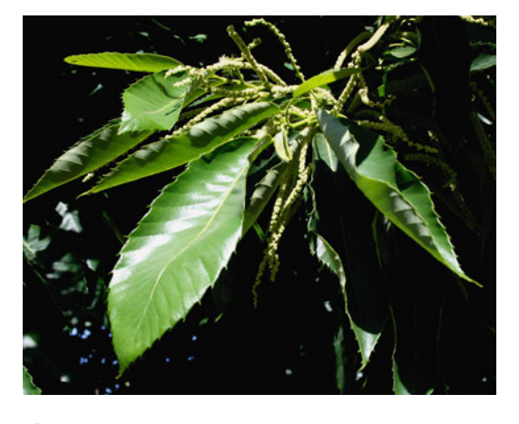
Plate 2 Elliptic leaves with serrated margins

with 1–7 perianth, 1 pistil, inferior ovary with 3-6(-9) locules, style and carpels as many as locules; placentation axile; ovules anatropous, 2 per locule. Fruit is 1.3-2.5 cm in diameter, with each spiny cupule or burr (Plate 3) consisting of 1–4