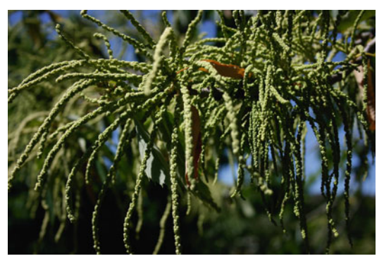
Plate 3 Chestnut catkins