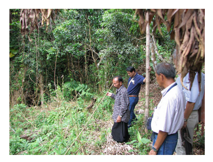
Fig. 10.3 A local farmer in Chiang Mai Province, Northern Thailand explaining his techniques for managing this agroforest for producing a special type of bamboo to make traditional pipes

The duration and management of the fallow phase differ across cultures, space, and time. The duration of the forest fallow phase is normally above 10 years sufficient for recovery of soil fertility—with a general preference for the forest re-growth of between 10 and 20 years (Brookfield et al. 1995). As forests re-establish through natural successional processes during the fallow phase, products of these natural forest fallows are collected by the local people. Inter-planting during the forest fallow phase are practices widely used by indigenous communities to produce forest products and to accelerate soil regeneration (Burgers et al. 2005; Michon et al. 2007).