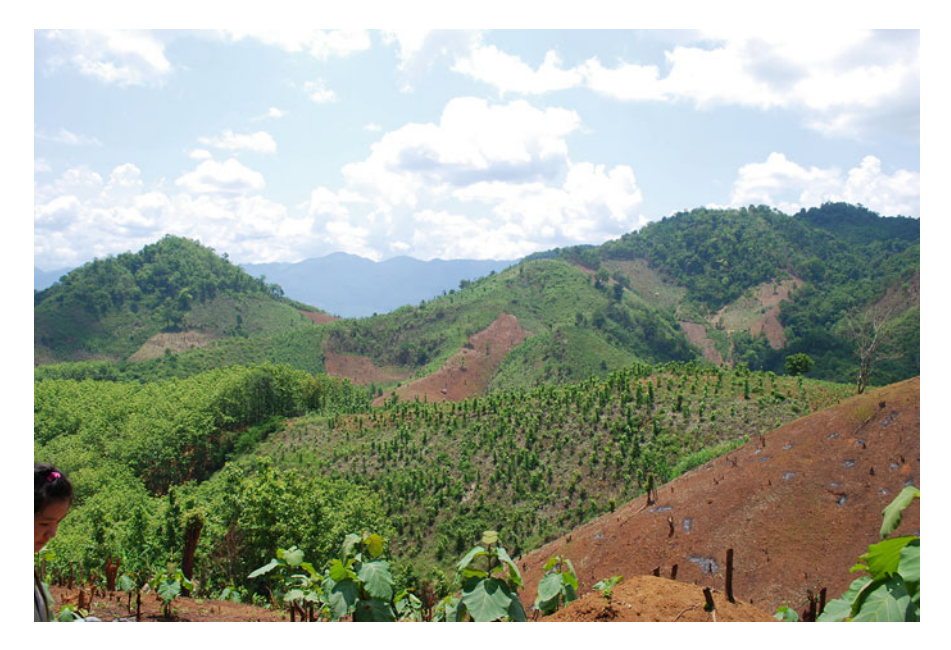
Fig. 10.5 Conversion of traditional shifting cultivation to teak plantation in Luang Prabang Province, Lao PDR

(Colchester and Fay 2007). Similarly, the Indonesian government controls all forests; of Indonesia's estimated 86 million ha of forest, about 27% was allocated to private companies for logging and plantation, while about 0.2% was given limited use rights as 'community forest' (Colchester and Fay 2007). This eventually led to state management of forests mainly for the sake of industrial forestry interests. The state hands the rights to harvest timber to private companies, thus excluding local communities from the forests (WRM 2002b). Consequently, swidden agriculture, once the dominant form of land use throughout the uplands and much of the low-lands of Southeast Asia, is being replaced by other land uses (Rerkasem et al. 2009a)(Fig. 10.5).