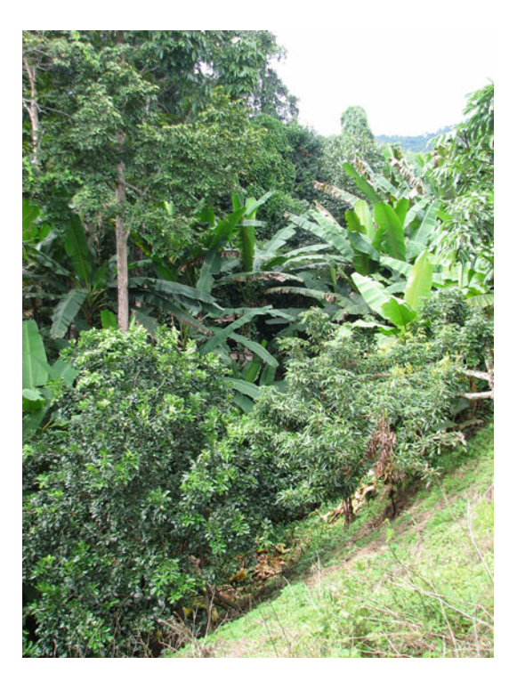
Fig. 10.2 Agroforest in Chiang Mai Province, Northern Thailand

and pulau, forest areas set aside for production of essential items such as timber for house construction, boat building, jungle vegetables, rattan and other nontimber forest products, hunting, and protection of water catchment areas (Majid-Cooke 2005).