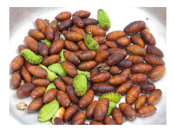
Fig. 10.4 Edible pupae of forest insects are a traditional non-timber forest product in Luang Prabang Province, Northern Lao PDR