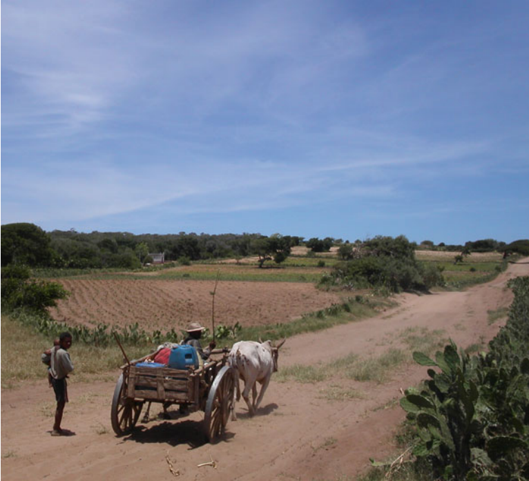
Fig. 24.2 Transporting water in a dry landscape with taboo forest in the background (including Christian tomb at the edge of the patch)

The Tandroy and their livestock coexist with the highly endemic flora and fauna in an arid and drought prone environment. Their way of life and the associated values are challenged by biophysical stresses as well as by social conflicts and disruptions. Some are well known and expected, such as extended drought periods or the death of the chief elder, while others may be novel, such as the new forms of Christianity that confront customary rules, or chronic drought conditions occurring during the last 15 years (Elmqvist et al. 2007). The Tandroy have to reconcile need, conflict and disturbance in order to maintain the ability of these coupled social-ecological systems to continue to exist over time. Here as well as in most parts of Madagascar, social taboos play a key role in maintaining social order, and also impact the relationship between people and forest (Ruud 1970). The taboos and with them the taboo forests are upheld by social events and rituals. In this context, tree-planting has a double significance. Culturally, planting trees serves as a symbol of renewal, purification, agreement and boundary-making; ecologically, planting trees contributes to the generation of ecosystem services in a fragmented landscape.