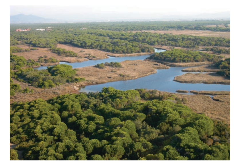
Fig. 6.5 Wetlands of the Trappola: aerial view of the Porciatti marshes