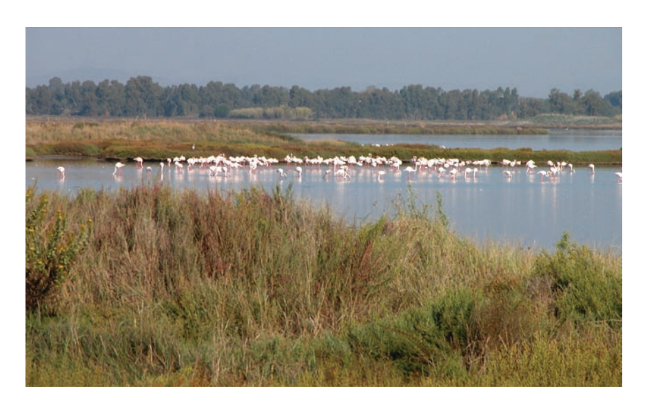
Fig. 6.9 The Orbetello Lagoon with resident Greater Flamingos

Its geographic position together with the presence of brackish wetlands are of crucial importance for resting and nesting of many endangered bird species.