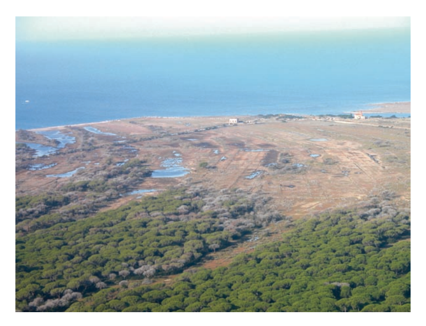
Fig. 6.8 Wetlands to the south of the Ombrone River mouth