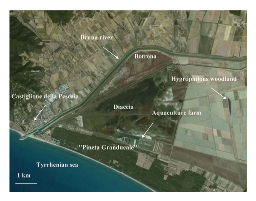
Fig. 6.2 Diaccia Botrona Provincial Nature Reserve: map of the area (Modified from Google Maps)

and it is delimited by the Bruna River to the north-west, by the Affacciato bank and San Leopoldo Emissary channel to the east and by the coast to the south-west. Within the area lies the Diaccia Botrona Provincial Nature Reserve of about 1,000 ha that was declared a SPA (Special Protection Area, EC Directive) by a national law. The Reserve is subdivided in two main wetlands from which it takes its name: the Serrata of the Diaccia and that of the Botrona.