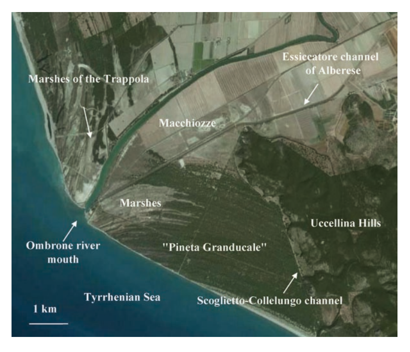
Fig. 6.4 Wetlands of the Maremma Regional Park: map of the area (Modified from Google Maps)

the river mouth there is an area in which the phenomenon of erosion and accretion of the beach is in equilibrium. From here onwards, and especially after Collelungo, there is a slow but progressive accretion of the beach. About 200 years ago this area was a marine gulf as testified by the topographical names (Porto Vecchio – Cala Francese – Cala Rossa). Now the area presents a very low dune belt (1–1.5 m above sea level) due to the positive sedimentation process still in progress (Colombini et al. 2007).