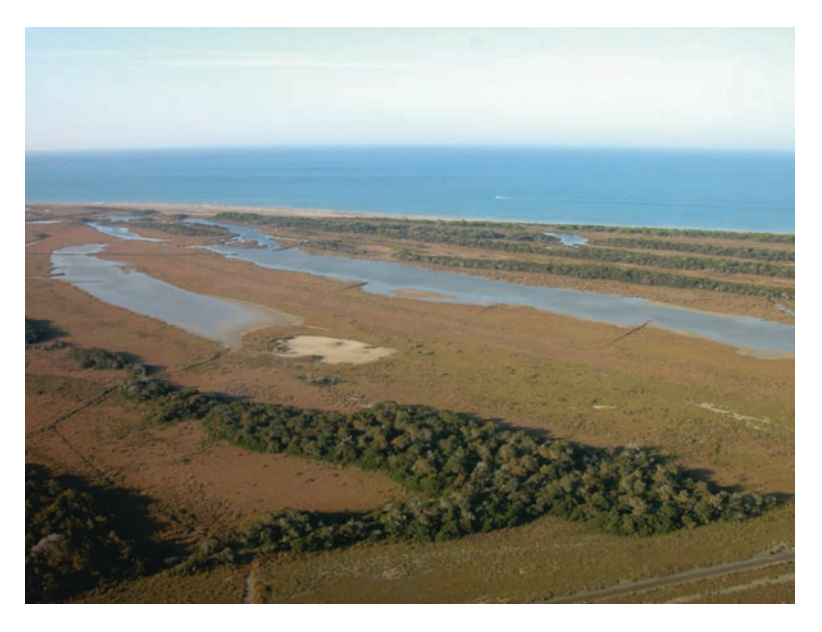
Fig. 6.7 Wetlands of the Trappola: aerial view of the interdunal wetland area