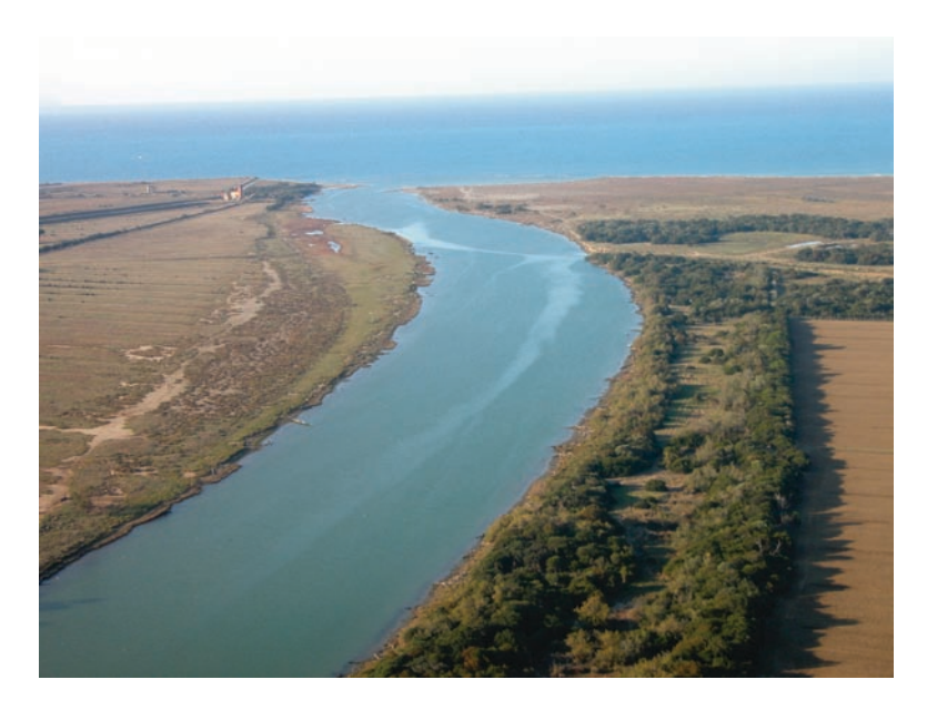
Fig. 6.1 The Ombrone River mouth

Nowadays, the delta of the Ombrone River is undergoing a strong erosion process that began during the second half of the nineteenth century after a long period of accretion that occurred more or less rapidly according to the different climatic conditions and the historical events (Pranzini 2001; Ciampi 2007) (Fig. 6.1). The relatively recent change in this trend was triggered by the beginning