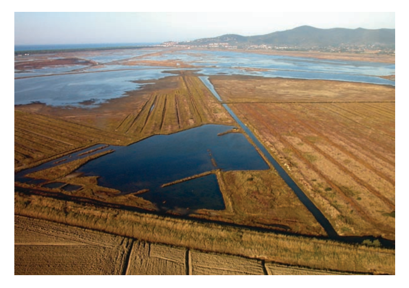
Fig. 6.3 Network of channels and wetlands of the Diaccia Botrona Provincial Nature Reserve

entire Reserve; the channels built to reclaim land together with the section of the Bruna River within the Reserve; the grounds of the 'border' areas.