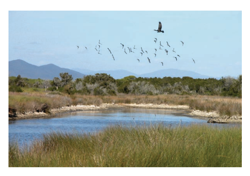
Fig. 6.6 Wetlands of the Trappola: pools with typical marshland vegetation

The marshland vegetation of the Maremma Regional Park is a complex mosaic of plants due to variations in water quality (fresh or salty), duration of submersion and to substrate type (sand, mud and clay). The marshland vegetation mainly occurs in areas of the Trappola, in those close to the Ombrone River mouth and at the 'Paduletto' at Collelungo. In wetland areas, tree formations are scarce and limited