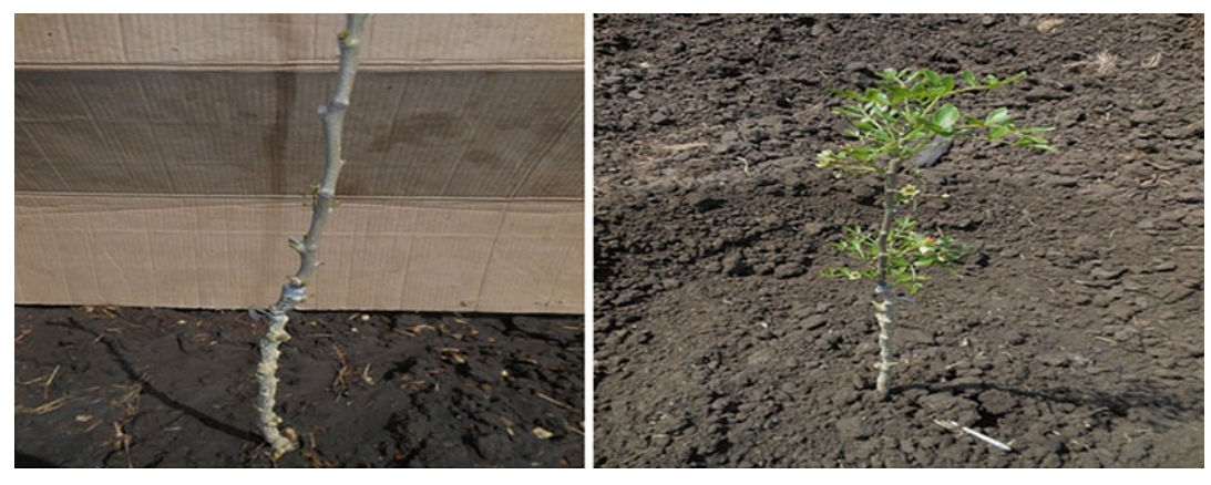
In situ softwood grafting

months for the rootstock seedlings to become ready for grafting. The plants are grafted in situ during March when there is leaf fall on the mother tree. The graft starts sprouting after 15 days after grafting. The percent success was as high as 80 %. Thus, the orchard can be established under rainfed condition in semiarid areas (Hiwale 2006).