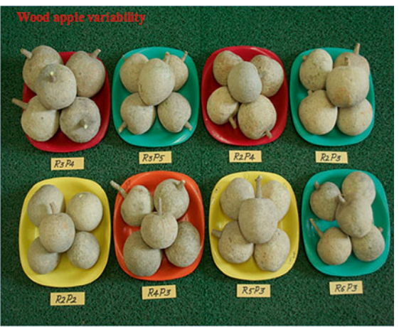
wood apple germplasm