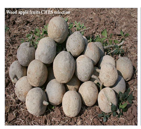
Fruits of CHES selection