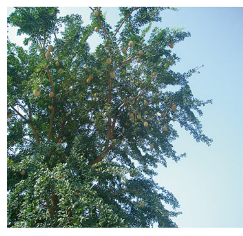
Wood apple tree in bearing