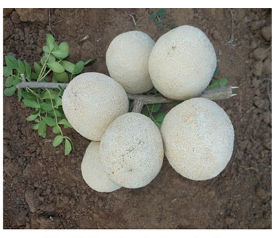
Bunch bearing in the selection