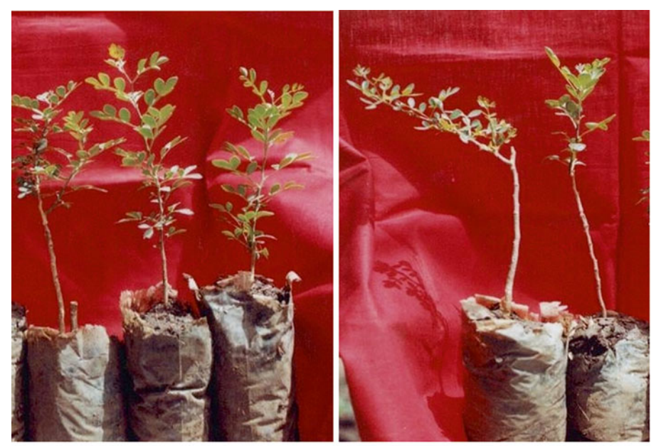
Local root stock