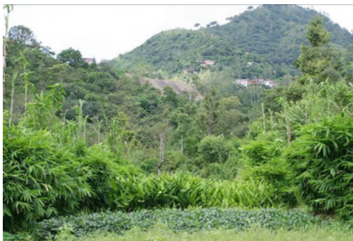
Fig. 2.7 Bamboo-based agroforestry system: Tulsi, ginger, soybean, turmeric, and aloe vera as inter-crop

INR 2,84,676 ha -1 and INR 5,31,966 ha -1 in the kharif season from the cultivation of tomato.