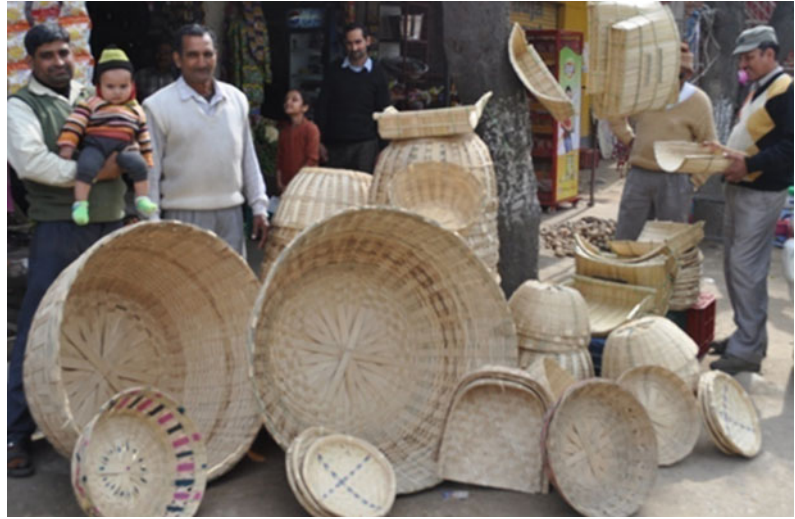
Fig. 2.2 Handmade bamboo artifacts for sale in the market of Himachal Pradesh