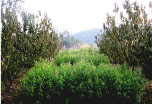
Fig. 2.6 Tulsi ( Ocimum sanctum ) cultivated as intercrop with peach ( Prunus persica )

in the open due to more biomass production (Table 2.15). Therefore, agroforestry with aromatic and medicinal plants in the mid-hill sub-humid zone of the Himalayan region is a viable option for climate change for CO 2 mitigation.