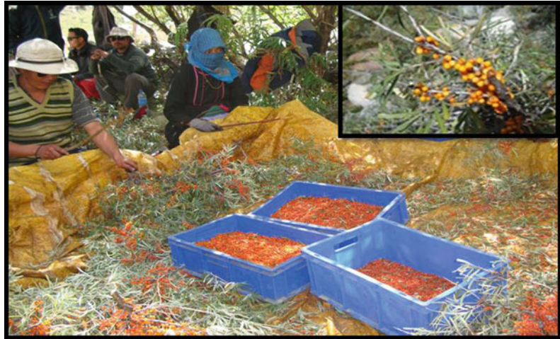
Fig. 2.3 Seabuck-thorn ( Hippophae rhamnoides ) fruits harvested by the local people for sale and domestic purposes. Inset showing the fruit branch of seabuckthorn