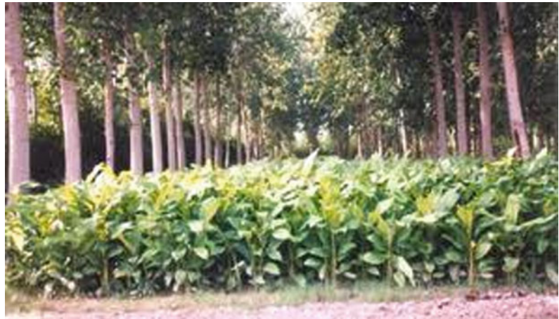
Fig. 2.5 Poplar ( Populus deltoides ) with turmeric ( Curcuma domestica ) as inter-crop

particularly with commercial crops (Fig. 2.5) like turmeric ( Curcuma domestica ) and ginger ( Zingiber officinale ).