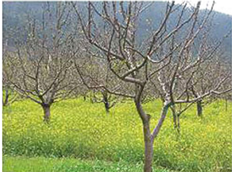
Fig. 2.8 Cultivation of apple ( Malus pumila ) with mustard ( Brassica juncea ) in Himachal Pradesh

additional benefits. Maximum fodder yield (8.43 kg tree -1 yr -1 ) was obtained in closely spaced alleys and maximum fuel wood of 14.22 t ha -1 was obtained where alley width was maintained at 1.5 m (Table 2.20).