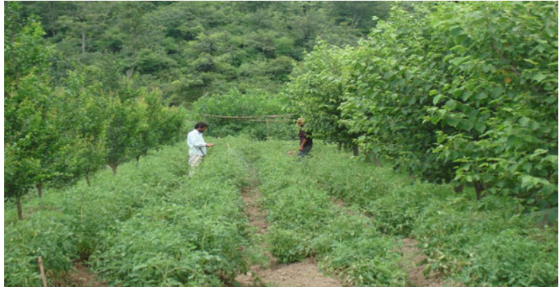
Fig. 2.4 Tomato ( Solanum lycopersicum ) as inter-crop with Grewia optiva trees