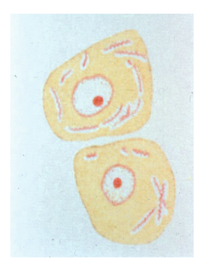
Fig. 1.1 Bizzozero's illustration showing numerous "spirilli" in the protoplasm of glandular neck cells (from [12])

With hindsight, we can see why H. pylori was not discovered by these investigators. Spiral bacteria appeared to be quite common in mammals, so the sighting of the bacteria in human specimens by several investigators in different countries was not surprising (Table 1.1). In fact, bacteria in the putrid gastric contents of gastric cancer patients were to be expected. Apart from gastrectomy specimens, which would have been mostly from patients with advanced gastric cancer, there was no easy way to study fresh stomach tissue from normal humans. After resection, autolysis of the gastric mucosa commences almost immediately making H. pylori hard to find. Additionally, by the time patients present with gastric cancer, the H. pylori have often disappeared from an atrophic stomach [14].