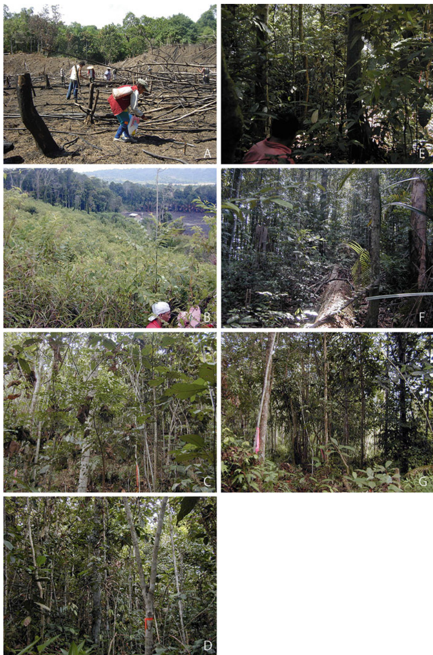
Fig. 2.2 General view of the study plots at different stages of regeneration or subject to different types of land use. (a) Currently cultivated swidden field (dissemination after slash and burn). (b) New fallow. (c) Young fallow. (d) Old fallow. (e) Continuous primary forest of the Lambir Hills National Park. (f) Fragmented primary forest. (g) Extensive rubber garden. See Table 2.1 for details about each land-use type.