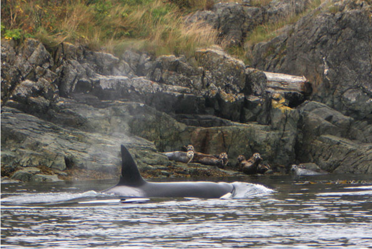
Fig. 4.3 A female transient killer whale hunting for the preferred prey of this ecotype, harbour seals.