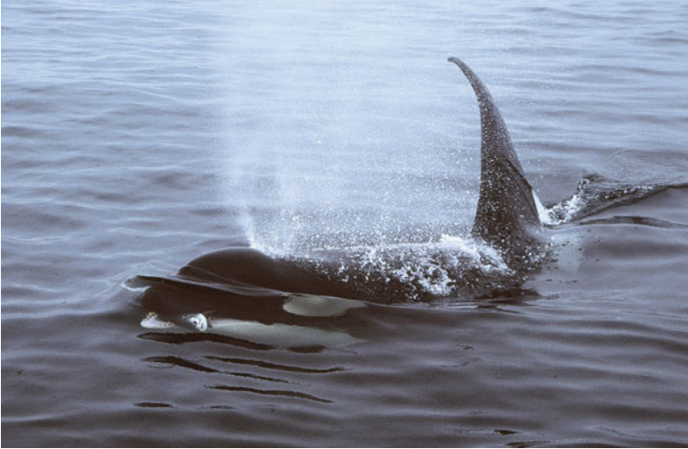
Fig. 4.1 A male resident killer whale surfaces following capture of a Chinook salmon, the primary prey species of this ecotype.

common of the five salmonid species available in the whales' habitat (Ford and Ellis 2006). Chinook predominated in our samples even when other salmonids, such as sockeye ( O. nerka ) and pink ( O. gorbuscha ) salmon, were far more abundant in foraging areas during summer spawning migrations, outnumbering Chinook by as many as 500 fish to 1 (Ford et al. 1998; Ford and Ellis 2006). Chum salmon ( O. keta ) are significant prey during a short period in the fall, but Chinook still appear to be taken preferentially. Prey remains recovered from beach-cast carcasses of residents are generally consistent with our observations of predation. Chinook salmon has been identified in most stomach contents to date, and various non-salmonids and squid have also been represented occasionally (Ford et al. 1998).