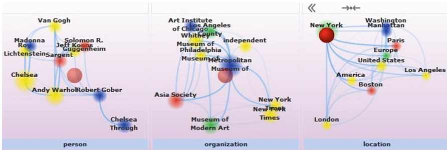
Fig. 2. Searchpoint visualization of entities. In location window red dot is dragged up to the Brooklyn.

Once data is pre-processed and stored it needs to be presented properly. A regular search form is upgraded with a faceted search interface to help the users in browsing around and is appropriate for explorative analysis. If the users know more specifically what they are looking for, they can search across several dimensions and get the search results with all contextual information. One of goals of Archive Explorer is to put a power of the queries and advantages of the visualization together to make context useful and transparent. An application for dynamic re-ranking and visualization of search results Searchpoint [3] is used to let users sort the search results. It uses entities, connections between entities and articles for ranking and ordering.