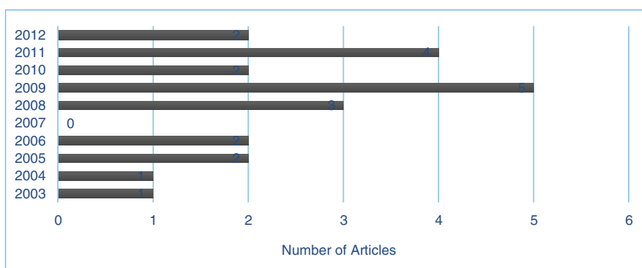
Fig. 1. Distribution of articles over time

of this study, the analysis included journal articles that went through a process of peer review, but columns, commentaries, editorial materials, and letters were excluded. After further comprehensive reviews through three researchers, a total of 41 document items from 2003 to 2012 were located through the researchers with the keywords as follows: simulation, virtual reality, 3D social virtual worlds (SVWs), 3D MUVes, MOOs, MUDs, virtual learning environments, and MMORPGs. After coding the data, only 23 articles were considered as MUVes (see Fig. 1 for the distribution of articles over time). These articles have to fit the definitions of MUVes as follows: (1) A shared space which is multi-user domain, (2) Persistence of the in-world environment, (3) Aim for bringing simulated real life experiences, such as topography, movement, and physics that offer the illusion of being there, and (4) Optional: Non-player characters (NPCs), data-recording features, 2D, or 3D [11].