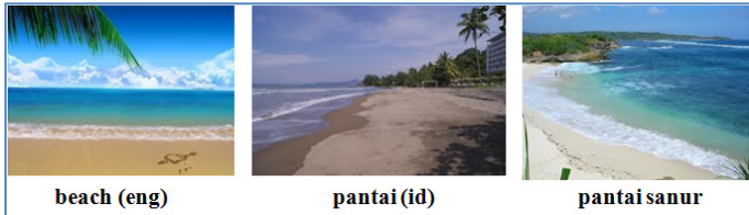
Fig. 1. Image-Language Semantic

Another motivation of this research is the possibility of image-language semantic, which based on the idea of finding semantically related text in visually-similar images. This idea offers alternative way of exploring relationship among term’s meaning across languages that could be used to build thesaurus, dictionaries, question answering modules etc. The argument is that similar images might contain text caption that is possibly related. For instance if we can recognize the similarity among images in Figure 1, then we might draw inferences that word ‘beach’ is related with ‘pantai’ and ‘sanur’. Moreover, with some work on the reasoning part, we also can infer that ‘sanur’ is a ‘beach’ and ‘pantai’ is translation of ‘beach’ in Indonesian language.