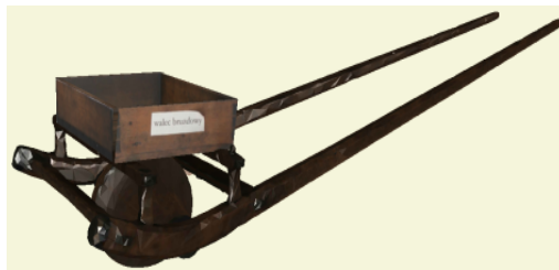
Fig. 3. A final 3D content representation

The plough , which is a virtual museum artefact, is a structural component that consists of the three geometrical components—a box, a wheel and a frame ( S5-S7 ). The SLP2 is applied to the S5-S7 —in the resulting PSR, instructions that create new objects in the scene, precede instructions that link these objects by properties ( T3 ). In the example, the resulting PSR (an ActionScript document) includes the Ts in the required order, with the proper TPs specified. The PIR has been created with the Protégé editor. However, a tool for visual semantic modelling can be developed.