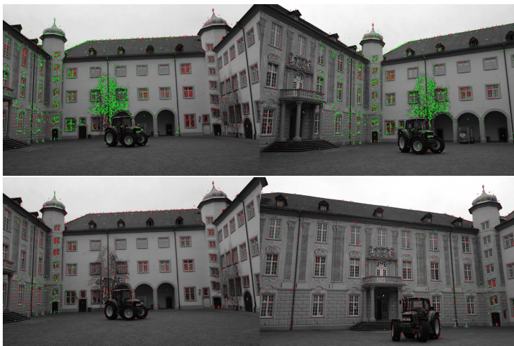
Fig. 2. Pairs (0,1) on top and (0,4) on bottom of the used Strecha’s Castle-P19 sequence. For visualization purposes, the data matches were classified as inliers (green) and outliers (red) using an arbitrary threshold of 3 pixels on groundtruth errors.

Evaluation errors (see Section 4) are shown in the last 4 columns of Table 2. Pair (0,5) is not reasonably solved on average by any of the methods, although occasionally all of them found a good solution. We highlight in bold the best results among the three non-parametric methods (ORSA, Hiso, Hani) excluding RANSAC, but at the same time we keep the RANSAC output in the table for the reader to see the sometimes dramatic effect of parameter selection. According to our preliminary experiments, ORSA gives slightly better average results than our proposals for medium-to-high inlier ratios, being worst on average otherwise, depending on the feature distribution – see for instance results on pair (0,4).