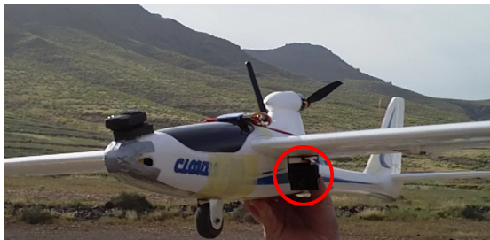
Fig. 2. Used Unmanned Aerial Vehicle, the camera position and orientation

The Fig. 2 shows the used UAV in the present work. This vehicle is provided with low cost camera. It is a mini camera 1/3" Sony CCD 420 TVL, with a