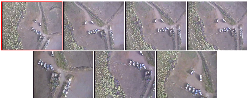
Fig. 3. Set of images captured at different altitude: higher (above) and lower (below) altitude. Red box denotes the reference image.

Original SURF algorithm over these images detects a large number of easily confused keypoints. Confusing keypoints should be filtered during the matching process. For instance, there are repetitive shapes on the images such as