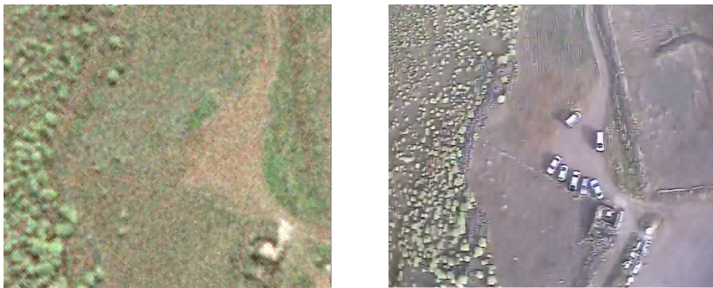
Fig. 1. Scene taken from a commercial cartographic (right) and the scene taken from our UAV (left)

That area belongs to a rural area in Gran Canaria Island, which is not correctly mapped yet by commercial aerial imagery.