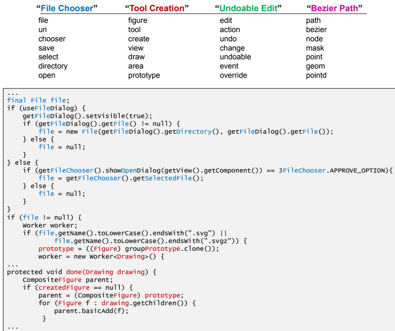
Fig. 5.3: Four example topics (their labels and top words) from JHotDraw 7.5.1. We also show a snippet of the file SVGCreateFromFileTool.java, with terms colored corresponding to the topic from which they came. In this example, no terms come from the “Undoable Edit” or “Bezier Path” topics.

associate observed variables (here, terms) with latent variables (here, topics). A rich literature exists on latent variable models [e.g., 74, 113]; for the purposes of this chapter, we omit the details necessary for computing the posterior distributions associated with such models.