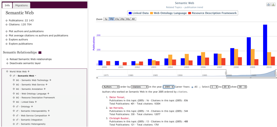
Fig. 2. Exploring the topic “Semantic Web” in Rexplore

For analyzing a topic, Rexplore provides an interface that includes: i) general information about the topic, ii) access to the relevant authors and publications, iii) the topic navigator , iv) visual analytics on broaderGeneric and contributesTo sub-topics, and v) visual analytics on authors’ migration patterns from other topics to and from the topic in question. As an example, Figure 2 shows the page for the topic “Semantic Web”, which (on the left) includes basic statistics, access to basic functionalities, and the topic navigator showing the relevant fragment of the topic hierarchy generated by Klink. On the right hand side of the figure, a histogram is shown, as the user has selected to visualize the publication trends for research in Linked Data, OWL and RDF. In particular, Figure 2 shows that the Linked Data area has exploded in the past few years, while research in OWL appears to have reached a plateau.