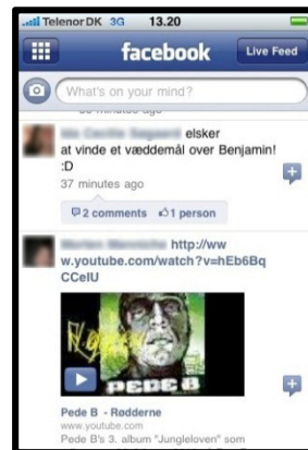
Fig. 1. Example of probe response picture

From an analytical perspective, the Mobile probe method objective was not to reach a single unambiguous answer or solution, but rather the responses should let the researcher become inspired by the participants [1]. With the aim to support the project's rigidity in the analysis phase, while keeping a user-centric focus, user experience goals and cognitive process variables were applied to the analysis. The cognitive processes were identified as: attention, perception & recognition, memory, learning and problem-solving, planning etc. The user experience goals were identified, as: satisfying, enjoyable, provocative, boring, etc. (All derived from [9]).