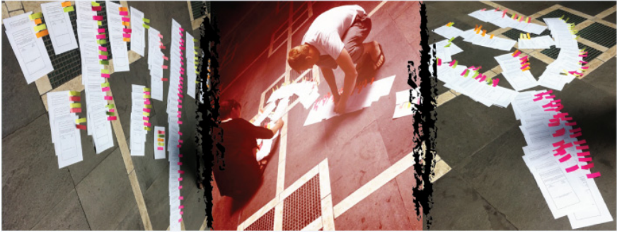
Fig. 4. Bodily engagement into the collaborative analysis