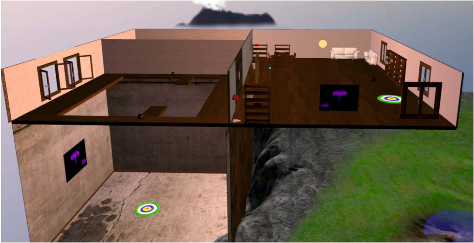
Fig. 1. The virtual environment as presented in the user study

covered with a virtual glass floor, therefore it was possible to walk right over it (actually nearly nobody did this).