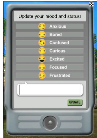
Fig. 2. Self-report device

talking with non-player characters to gather clues about the disease's source. To progress through the mystery, a student must explore the world and interact with other characters while forming questions, generating hypotheses, collecting data, and testing hypotheses.