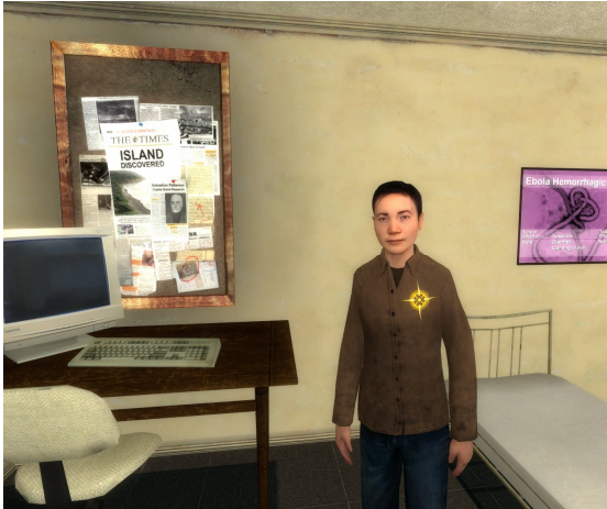
Fig. 1. Crystal ISLAND learning environment