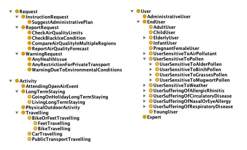
Fig. 2. Excerpt of the PESCaDO Problem component

class "AnyHealthIssue" enables to propose to the users only some activities, those of type "AttendingOpenAirEvent" or "PhysicalOutdoorActivity" or "Travelling", forcing them to select one of those. Further parameters are also defined to allow the specification of all the necessary details to compose a complete problem description: for instance, the time period and geographical region considered in the request.