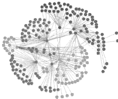
Fig. 2. Scale Free network: Small number of nodes with high degree and a large number of nodes with low degree

Scale free structure: The degree distribution shows a scale free structure that is a heterogeneous network topology encompassing a relatively small number of nodes with exceptionally high degree and a very large number of nodes with low degree (figure 2). One remarkable feature of scale-free networks is that they are highly robust against random errors but on the contrary they are highly vulnerable to attacks targeting nodes which serve as hubs in the network. The scale free modeling lays the emphasis on the network dynamics and its main objective is to model the process that underpins the evolution of complex networks since such an approach will lead to the creation of networks with the correct structure [20, 25].