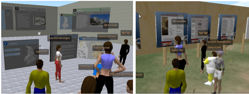
Fig. 3. Group presentation inside the VW

The lecture was organized around an authentic, ill-defined problem according to the tenets of PBL, which was given to the students in the following statement of a ‘design brief’: “ Design the user interface of a multimedia kiosk system for browsing available rooms to let in the island of Syros. The intended users are tourists (Greeks and foreigners), who can access the system from the harbour of Syros. You should take into account usability guidelines for multimedia presentations and information seeking. You should design the 5-7 most basic screens of the system, in wireframes ”. In addition, the participants were presented with an abstract work plan that included tasks that they could choose to follow with indicative times for completion.