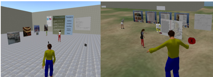
Fig. 1. Screenshots of the environment

The VW implementation (Fig. 1) has been based entirely on open source software. The world server was installed in a standalone PC using the OpenSimulator platform, 3 and the FreeSwitch server 4 has been set up and connected to the environment to provide voice communication support. We have created a small island and built a number of interior and exterior places for group collaboration and whole class activities. We implemented four additional collaboration tools in the LSL Scripting language. On the client side, the Hippo OpenSim Viewer 5 was running on PCs with standard keyboard and mouse equipment plus an additional headset with microphone for voice communication. No significant decrease in efficiency or loss of quality has been detected during the whole experiment.