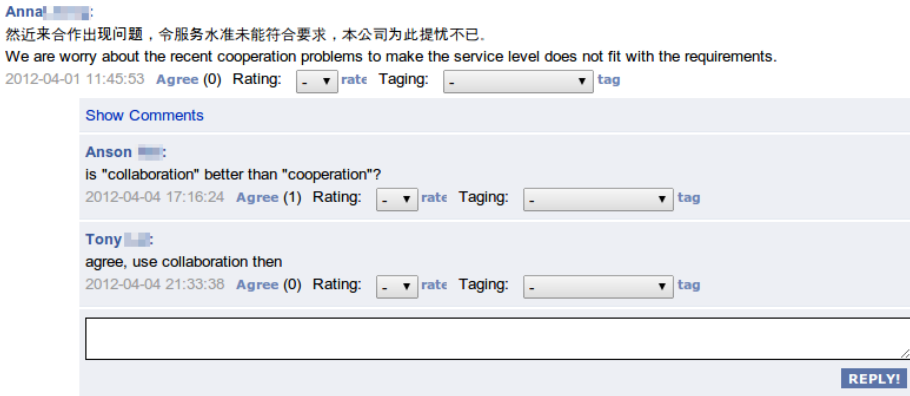
Fig. 3. TransWiki discussion

function. Ratings allow the instructor to indicate how significant a contribution the given discussion post has made and are on a 5-point Likert scale (-2, -1, 0, 1, 2). Tags indicate the type of contribution made, and can be one of the following nine options: Informative, Argumentative, Evaluative, Elicitive, Responsive, Confirmation, Directive, Off task, or Off task technical. Rating and tagging together thus capture both a quantitative as well as a qualitative assessment of each discussion statement.