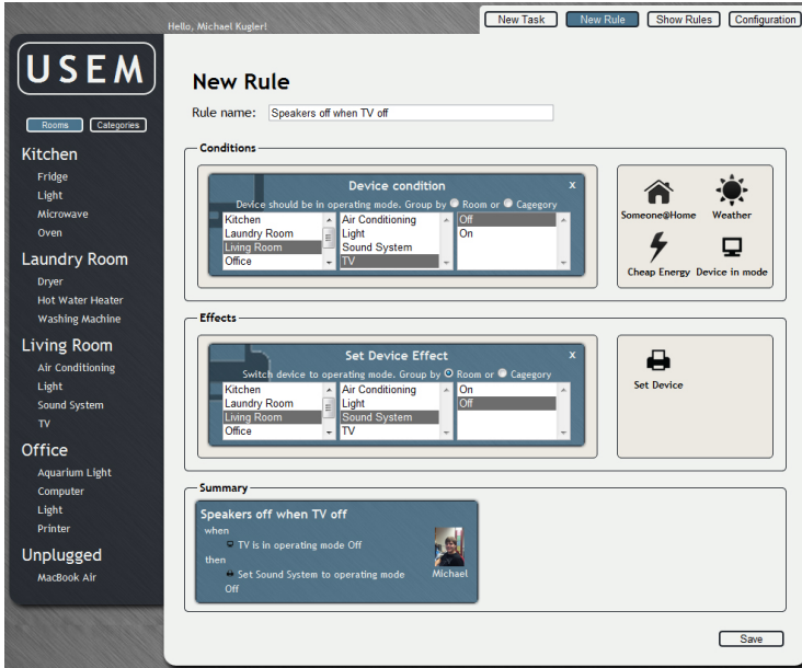
Fig. 1. The Rule Editor of the web interface component of USEM

for smart phones and tablets which can be used to control and monitor energy use while mobile. The system also provides a web interface for setting rules, tasks, and levels for controlling regular and continuous devices. In this section we describe the web interface of USEM.