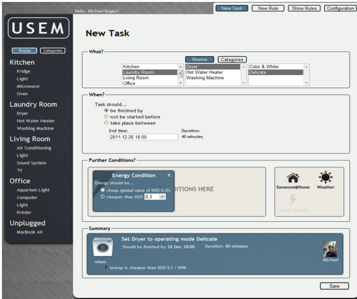
Fig. 2. The Task Editor of the web interface component of USEM

similar to that of the Rule Editor. The web interface provides a summary of the task which is going to be created at the bottom.