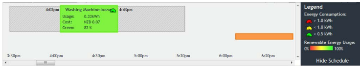
Fig. 3. An example schedule with detailed information shown for a selected task