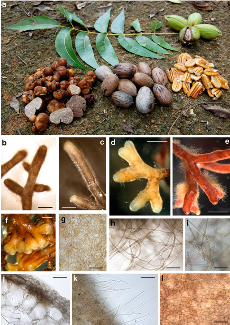
Fig. 15.2 Pecan, nuts, truffles, and some mycorrhization success on pine ( Pinus taeda ) and pecan ( Carya illinoensis ). (a) Adult pecan branch with nuts and T. lyonii fruiting bodies collected in a commercial orchard. (b) T. aestivum ectomycorrhizas (EMs) on C. illinoensis seedlings (bar = 500 \mu m). (c) T. borchii EMs on C. illinoensis seedlings (bar = 500 \mu m). (d) T. borchii EMs on P. taeda (bar = 500 \mu m). (e) Mycelial net T. canaliculatum EMs on P. taeda (bar = 500 \mu m). (f) Growing T. canaliculatum EMs on P. taeda (bar = 200 \mu m). (g) Outer mantle cells of T. borchii EMs on C. illinoensis seedlings (bar = 30 \mu m). (h) Cystidia of T. aestivum EMs on C. illinoensis seedlings (bar = 30 \mu m). (i) Cystidia of T. canaliculatum EMs on P. taeda seedlings (bar = 30 \mu m). (j) Cross section of T. aestivum EM on C. illinoensis (bar = 30 \mu m). (k) Cystidia of T. borchii EMs on C. illinoensis seedlings (bar = 30 \mu m). (l) Outer mantle type of T. aestivum EMs on C. illinoensis seedlings (bar = 30 \mu m)