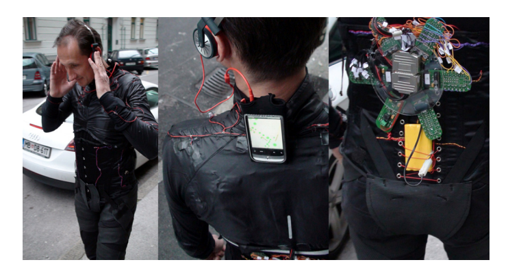
Fig. 3. The Psychoplastic bodysuit during use in Ljubljana 2010

The third iteration of the design replaced the laptop with the use of smartphones. This increased both comfort and maneuverability due to the smartphones weight and small form factor.