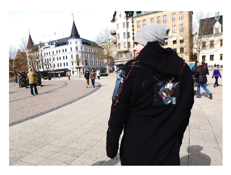
Fig. 4. The Sense Memory Cape during the Malmö test