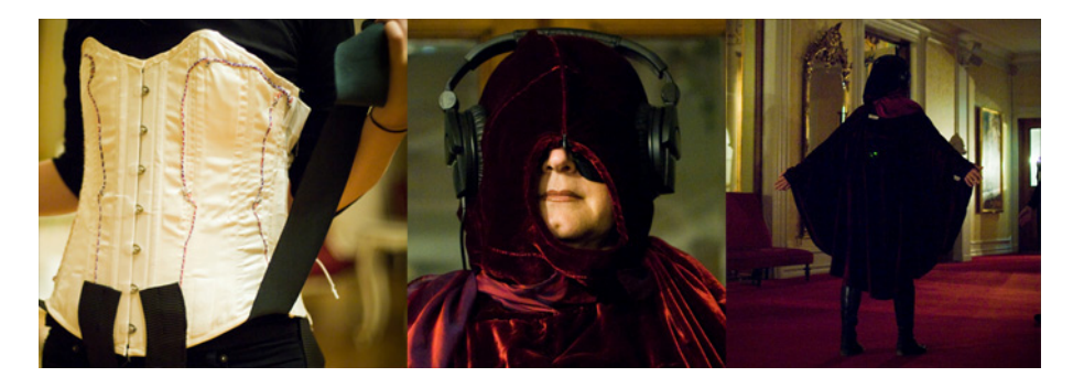
Fig. 2. The bodysuit for the Blind Theater. The haptic suit had two functional layers, one inner corsette and an outer, looser-fit cape.

The next iteration of the system was named 'The Blind Theatre' and turned the body into the stage of a somatic theatre (Fig. 1 and 2). It was performed indoors in 2009 at the Norwegian National Theatre in Oslo<sup>3</sup>. Users experienced an audio-haptic story while walking blindfolded around in the theatre. They reported high-order tactile percepts such as stroking, rubbing and caressing [27].