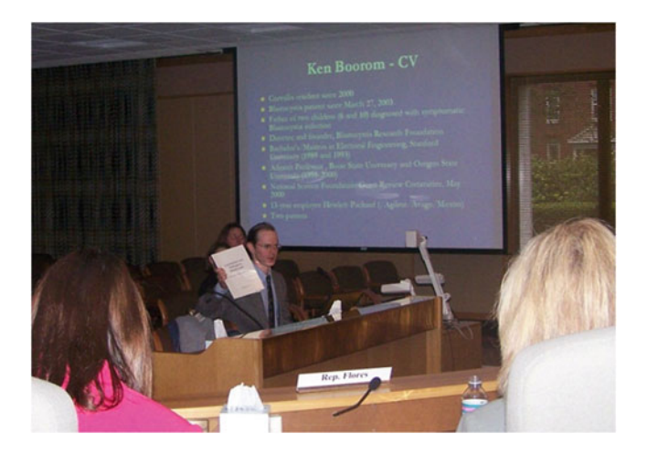
Fig. 8.6 The author testifying to the State of Oregon Health Policy Committee in support of making Blastocystis a reportable infection in Oregon