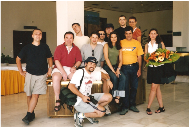
Participants of MEDICON 2001

CROMBES is active in promoting clinical engineering and in cooperation with IFMBE it has been working on projects for registering and certifying clinical engineers as well as on preparing a program for their continuous education. Within CROMBES, there are three professional sections: Clinical Engineering, Medical Physics, and Biomechanics Section, respectively. They are especially active within the clinical environment. CROMBES is also a member of international organizations: IFMBE, IOMP, EAMBES, ESEM, and EFOMP. Since 2002, CROMBES has annually presented award for the best diploma paper in the interdisciplinary field of biomedical engineering.