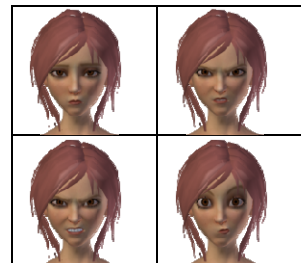
Fig. 3 Examples of Agent's Emotional expressions.