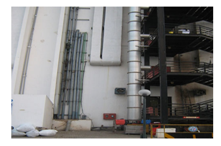
Fig. 6.6 Chute conveyor in modern hospital to transfer waste from individual wards in different floors to centralized storage area from where different category of waste will be collected and transported to common treatment facility

mercury which is toxic and generate immense amount of mercury vapours and waste while handling them, (4) department of peroidontics: major wastes in this department are tissues and scalpels and blades, (5) department of oral and maxillofacial surgery: this department generates extracted teeth, extracted teeth with amalgam, (6) department of prosthodontics: this department generates plaster of paris , stone casts, waxes and acrylic resins, (7) department of pedodontics: this department generates extracted teeth (8) department of orthodontics: this department generates orthodontic bands and arch wires-overnight immersion in 2 % glutaraldehyde.