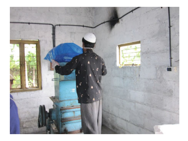
Fig. 6.14 Biomedical waste being fed into the shredder