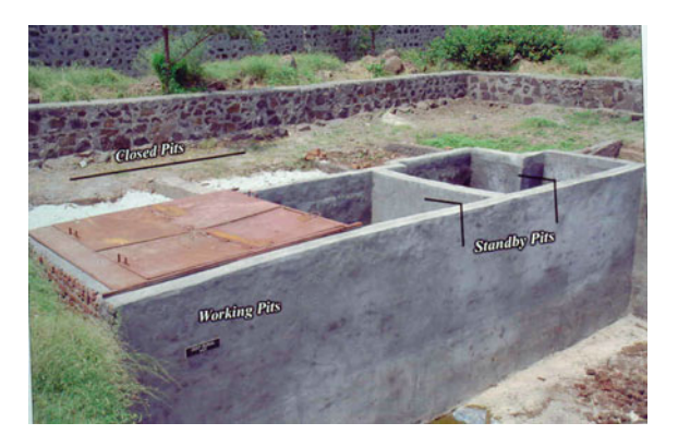
Fig. 6.15 Biomedical waste deep burial facility

secretions/excretions of infected birds. Avian flu outbreak during 2003 and 2004 resulted in the death/destruction of 44 million Birds and 29 million birds, in Vietnam and Thailand respectively. As of mid-2006, about 200 million domestic birds had either died or culled (FAO 2012).