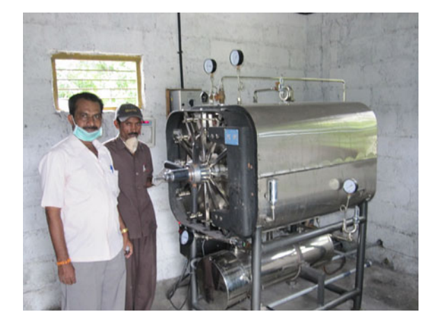
Fig. 6.13 Autoclave