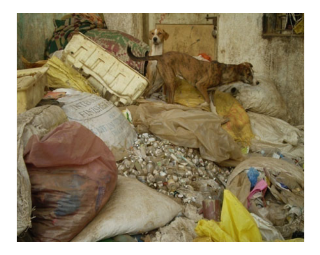
Fig. 6.1 Biomedical waste stored unscientifically for recycling

Group III—comprises of contaminated wastes, or potentially contaminated waste, and