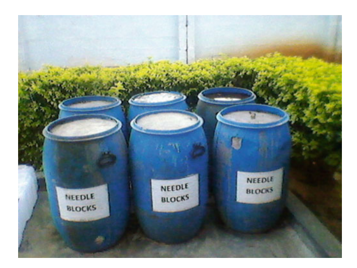
Fig. 6.7 Needle encapsulation