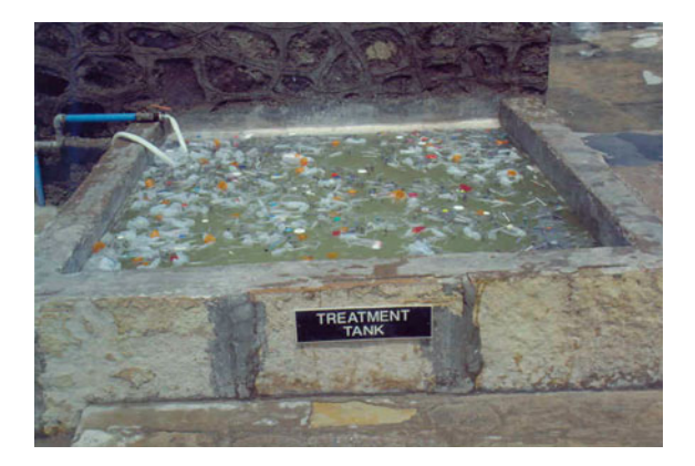
Fig. 6.16 Biomedical waste being chemically treated