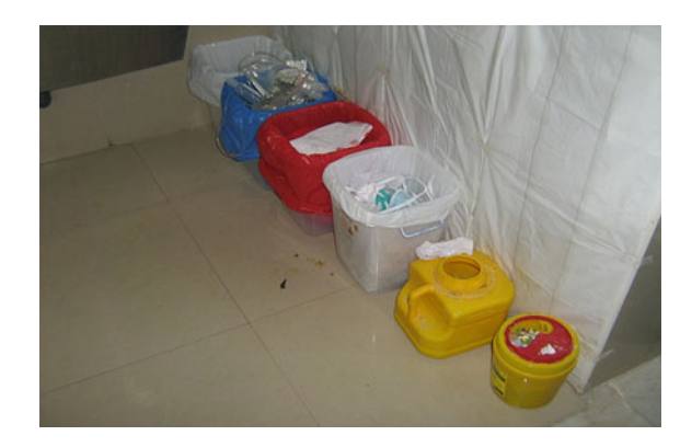
Fig. 6.5 A good practice of onsite segregation. The recycle waste like plastic, sharps and non infected waste shall be segregated to avoid generation of dioxins and furans due to combustion of all the waste and avoid increase in infected waste due to contact between infected and non-infected waste

storage area from where different categories of waste will be collected and transported to a common treatment facility. Failure to segregate infected waste at source may lead to rise in treatment and disposal cost as all the waste needs critical treatment and disposal methods to avoid spread of infection. The entry of mercury, lead and radioactive substances will have direct implication in terms of release of these heavy metals and radioactive substance into air, water, food and soil damaging flora and fauna and physic-chemical components of environment.