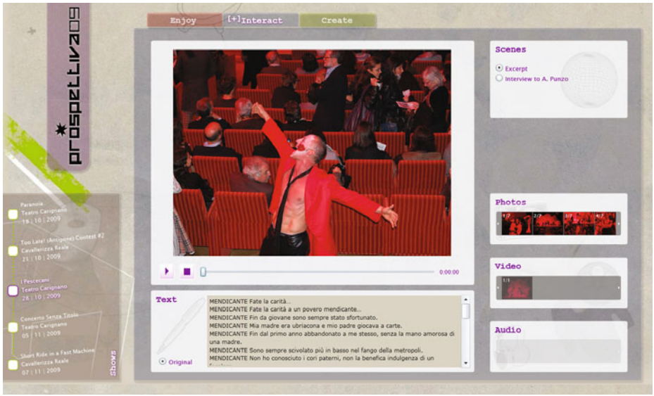
Fig. 5. The Interact section

so on. In other words, through this section each user can communicate his/her own perspective on a show, thus recalling the name itself of the festival, namely Prospettiva09 .