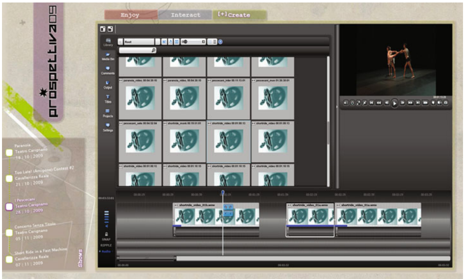
Fig. 6. The Create section

so on. In other words, through this section each user can communicate his/her own perspective on a show, thus recalling the name itself of the festival, namely Prospettiva09 .