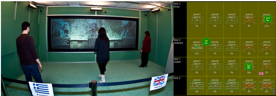
Fig. 1. (left) Overview of the museum exhibit; (right) zone map

Visitor appears or disappears: This query uses an aggregate operator grouping tuples by visitor ID and producing an output tuple when a window opens, identifying a new visitor and its location (x, y) . The window state is always the last position seen of a given visitor ID and its associated epoch. Windows must be updated at each epoch unless cameras can no longer locate the visitor. This query identifies internally whether a window misses an epoch update and if so, closes the window, producing a tuple with the location of the lost visitor. A subsequent operator checks whether the event took place at a valid (e.g., a door) or invalid (e.g., middle of the room) location.