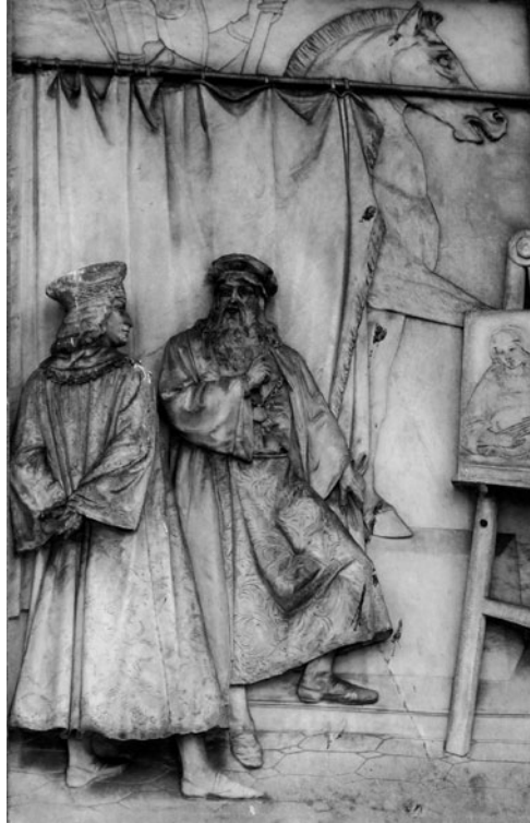
Fig. 2.1 Leonardo da Vinci depicted in a panel on the 1872 monument to Leonardo by Pietro Magi in the Piazza della Scala, Milan, Italy. The panels depict him as the archetypal Renaissance man by illustrating some of the many disciplines that he mastered: painting, sculpting, engineering and architecture. Paleontology and the other 'modern' sciences were not included in this nineteenth century celebration of his cultural importance