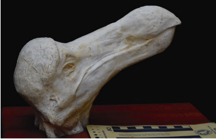
Fig. 2.2 The dodo of Mauritius, which became extinct in the late seventeenth century, is an icon of extinction in modern conservation biology and was also widely cited as a case of human caused extinction from the eighteenth century onwards. In his discussion of the extinction of the dodo in volume two of his Principles of Geology , Charles Lyell (1832, footnote on p. 151) writes that ‘the death of a species is so remarkable an event in natural history, that it deserves commemoration’. The photograph shows a plaster cast of a dodo head from a mould made before the head’s partial dissection in the 1840s

assumed to be due to repeated global catastrophes, was established by what we would now call Earth Scientists over 50 years before the science of ecology got its name. By the time Geikie was writing this had become well-established scientific ‘fact’ and was seen as a great step forward in our understanding of the history of life on Earth.