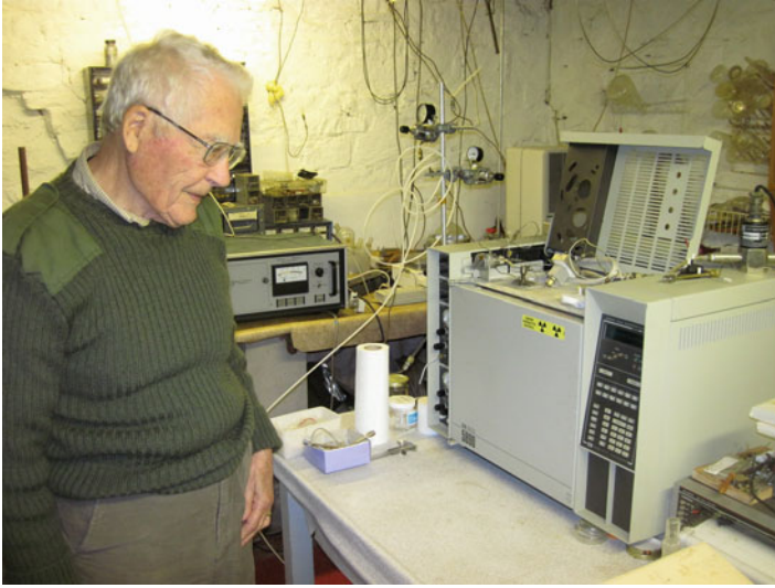
Fig. 2.6 James Lovelock (1919–) photographed in his lab in 2011 with a 1980s HP gas chromatograph – he was an advisor to Hewlett Packard on gas chromatography and used this technique in a number of groundbreaking studies of atmospheric chemistry studying an atmosphere in ‘extreme thermodynamic disequilibrium’ due to the presence of life. His concept of Gaia stresses the role of life as part of a single-coupled system, from which can emerge the sustained self-regulation of the Earth’s climate and chemistry at a habitable state for whatever is the current biota (Lovelock 2003.)