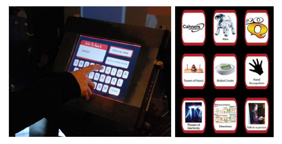
Fig. 2. Sample User Input Screens (Left: Given Name; Right: Museum Topics)

Tinker is projected human-sized to facilitate naturalness of interaction. We use multiple-choice touch screen input for user utterances, based on other work in developing a conversational agent for users who had no prior computer experience [22]. In addition to multiple choice utterance input screens, additional inputs were designed to enable visitors to input their given name and to quickly jump to different high-level topics using iconic representations (Figure 2).