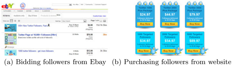
Fig. 1. Online Twitter Follower Trading Website

the distribution of both metrics of three account sets: missed spammers (false negatives) in each of three existing approaches [32,34,35], all accounts (around 500,000 collected accounts), and all spammers (2,060 identified spammers). (We label the results from [35] as A , [32] as B and [34] as C ). From Fig. 2(a) and 2(b), we can see that the distributions of these two indicators of those missed spammers by existing approaches are more similar to that of all accounts than that of all spammers . This observation implies that spammers are evolving to pretend to be more legitimate by gaining more followers.