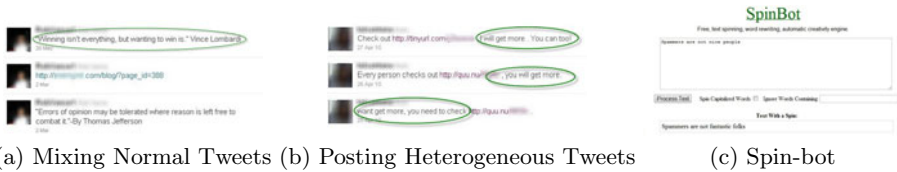
Fig. 3. Case studies for content-based feature evasion tactics

Posting Heterogeneous Tweets: In order to avoid content-based detection features such as tweet similarity and duplicate tweet count , spammers use tools to “spin” their tweets so that they can have heterogeneous tweets with the same semantic meaning using different words. Fig. 3(b) shows a spammer that posts various messages encouraging users to sign up for a service. The service is eventually a trap to steal users’ email addresses. Notice that the spammer uses three different phrases that have the same semantic meaning: “I will get more. You can too!”, “you will get more.”, and “want get more, you need to check”. An example of tools that can be used to create such heterogeneous tweets, called spin-bot [15], is shown in Fig. 3(c). By typing a phrase into the large text field and pressing “Process Text”, a new phrase with the same semantic meaning and yet different words is generated below.