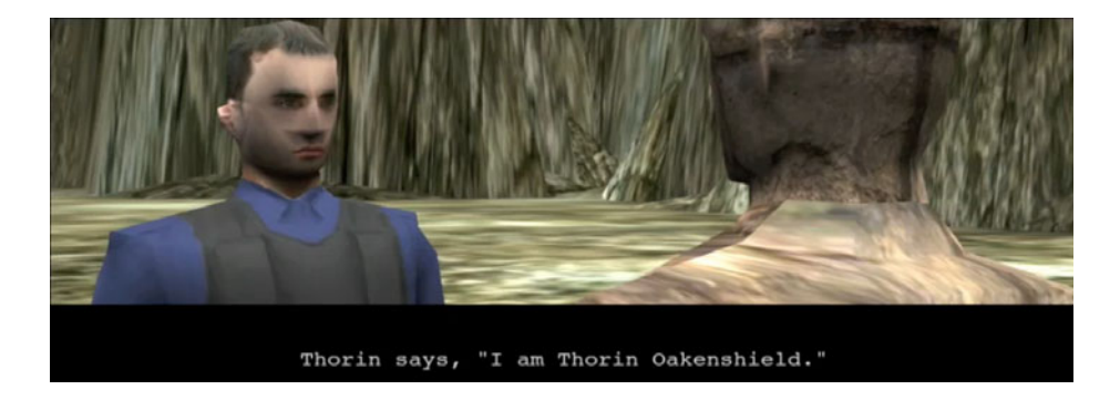
Fig. 1. A screen shot of a movie scene generated by Cambot

Besides generating game plots, we are also witnessing new interests in usergenerated digital media, which serves as the sole content source for popular social websites such as YouTube<sup>TM</sup>, Flickr<sup>TM</sup>, and many others. YouTube recently launched a new portal where users can design their own video clips using animation tools such as GoAnimate<sup>TM</sup> or Xtranormal<sup>TM</sup> to build custom videos featuring their own story plots, dialogues, and virtual avatars<sup>1</sup>.