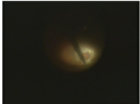
Fig. 4 Retinopexy of a retinal tear with endolaser

The goal of the endolaser retinopexy is to surround the retinal tear with 2 – 3 rows of endolaser impacts. The effect will be the same as after cryopexy: the healing of the retinal tear (fig. 4).