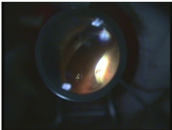
Fig. 3 Retinopexy of a retinal tear with exocryo

As postulated by Jules Gonin, the retinopexy is mandatory for retinal reattachment. During vitrectomy, this can be achieved either by exocryo (fig. 3) or by endolaser (fig. 4).