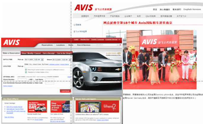
Fig. 2. – AVIS website in the USA 4 and in China 5

We chose the AVIS website because it was not elaborated with CVM, and it is clearly a cross-cultural application in the car rental domain that could be re-designed to promote cross-cultural contact. In it, we read that AVIS is “one of the world’s leading car rental brands and operates in more than 2,100 locations in the United States, Canada, Australia, New Zealand, Latin America and the Caribbean region” They have a USA-based Global website with more than 50 localized versions for countries around the world such as China, for instance (see Fig. 2).