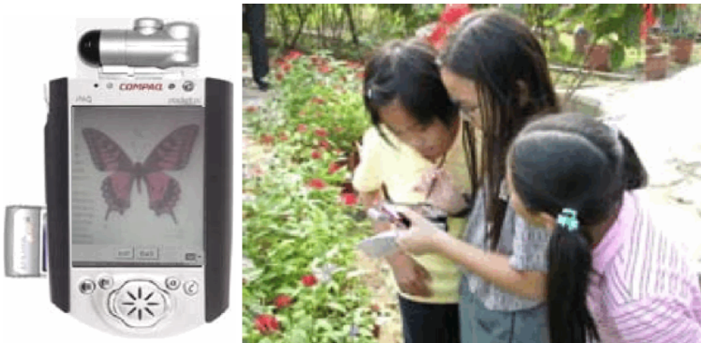
Fig. 1. The Butterfly-Watching System [1]

A possibility with mobile learning is to use the natural environment as a source of information. Some knowledge needs students learning through observation and is not very easy to teach by either traditional classroom teaching or web-based learning environment. Mobile application proves to be useful in this case. For example, the “Butterfly-Watching System” [3] supports an activity in which each learner takes a butterfly picture with a PDA (Fig. 1). Retrieval technique is applied on a database to search for the most closely matching butterfly information and is returned in real time to the learner’s device.