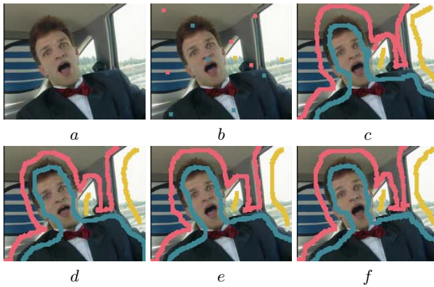
Fig. 3. Sets of markers on sequence carphone (a) frame 8 of extract from carphone sequence, b) few points on frame 8, c) heavy markers on frame 8, def) heavy markers on frame 4,8 and 11)