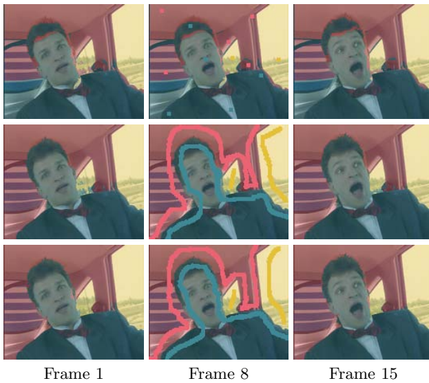
Fig. 4. Results of marker-based (P_1, \dots, P_n) -CC 2D+t ( \alpha = \omega = 40, A_{mean} = 10 ) using different set of markers, (top) points on frame 8, (middle) heavy markers on frame 8, (bottom) heavy markers on frame 4,8 and 11

no single parameter combination which achieves better results with all sets of markers. But, if we exclude the first set of markers (few points in the middle frame) which are clearly insufficient, we observe that (P_1, \dots, P_n) -CC t+2D and \alpha = \omega = 30 produces the best results with both remaining sets of markers. However, like the other two interactive methods, the interactive QFZ segmentation is very sensitive to the markers given by the user. This is illustrated by Fig. 4