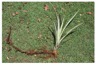
Fig. 2.2 Main distinctive traits of Ananas macrodontes : absence of a crown at the apex of the inflorescence and long floral bracts, presence of retrorse spines on the leaves, and vegetative reproduction by stolons

higher. The fruit flesh is low in acid and it contains numerous seeds. The plant appears to be highly selffertile. The natural habitat of A. macrodontes corresponds to humid forest areas, under semi-dense shade, in coastal and southern Brazil and in the drainage of the Paraguay and Paraná rivers, from southeastern Paraguay and northeastern Argentina up to Mato Grosso (Coppens d'Eeckenbrugge et al. 1997). The species even tolerates short periods of flooding (Bertoni 1919). Baker and Collins (1939) reported little variation for this species, while Bertoni (1919) distinguished five varieties and Camargo (cited by Reyes-Zumeta 1967) considered the possible distinction between three botanical varieties. Ferreira et al. (1992) reported appreciable variation in a limited sample from Paraguay and southern Brazil, which was confirmed by the restriction fragment length polymorphism (RFLP) study of Duval et al. (2001b). On the other hand, Duval et al. (2003) observed only one chlorotype among six accessions of the species. When selfed, clones of A. macrodontes produce uniform progenies (Collins 1960, and field observations by the authors).