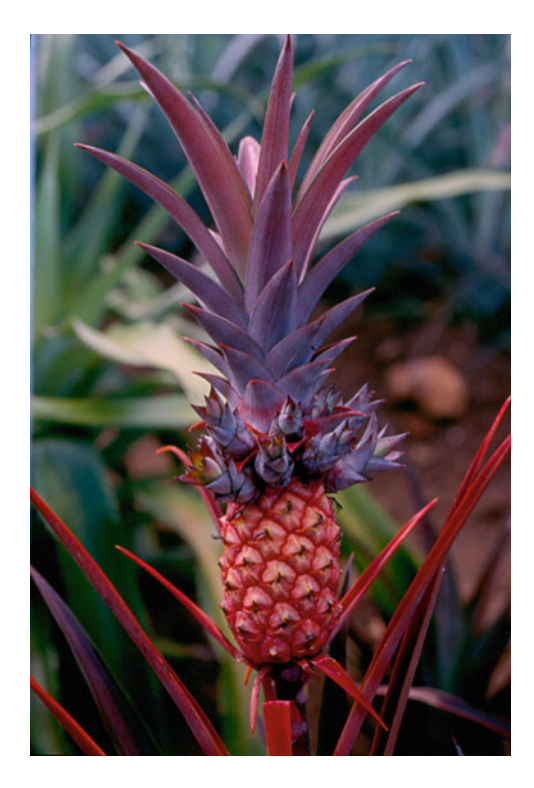
Fig. 2.5 Fruit of Ananas comosus var. erectifolius

Orinoco basin, and in the north of the Amazon basin, for the strong and long fibers associated with its typical erect habit. Indeed, the dry fibers constitute 6% of the plant weight. They are used to make hammocks and fishing nets (Leal and Amaya 1991), but now suffer competition from synthetic fibers and nylon. Vernacular names include curagua, curauá, curaná, kulaiwat, and pitte. The typical absence of spines along the leaf margin, as well as its erect habit, is the likely result of artificial selection for high yield of easily extractable fibers among strains of A. comosus var. ananassoides. The reverse mutation to spiny or partly spiny leaves has been observed under cultivation and in germplasm collections. Genetic diversity studies (Duval et al. 2001b, 2003) indicate that the domestication process that produced A. comosus var. erectifolius from A. comosus var. ananassoides has taken place independently at different times and/or places. This variety has recently found a new economic use in the production of cut flowers.