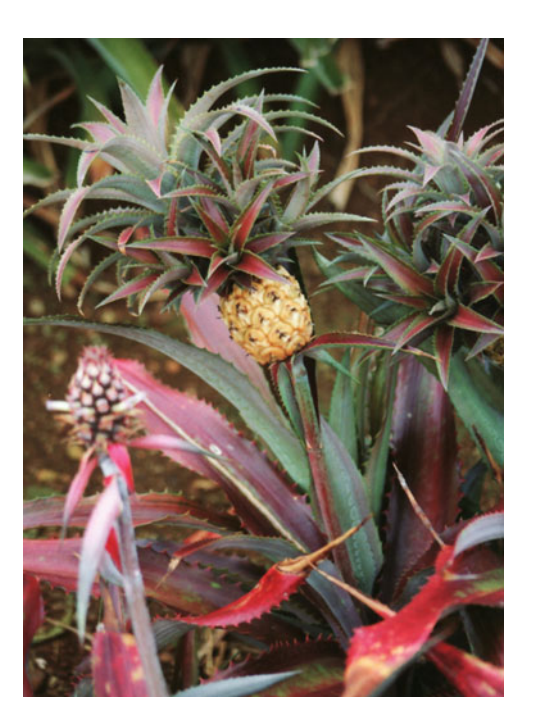
Fig. 2.6 Ananas comosus var. parguazensis

The wild A. comosus var. parguazensis is also very similar to A. comosus var. ananassoides , from which it differs by wider leaves, slightly constricted at their