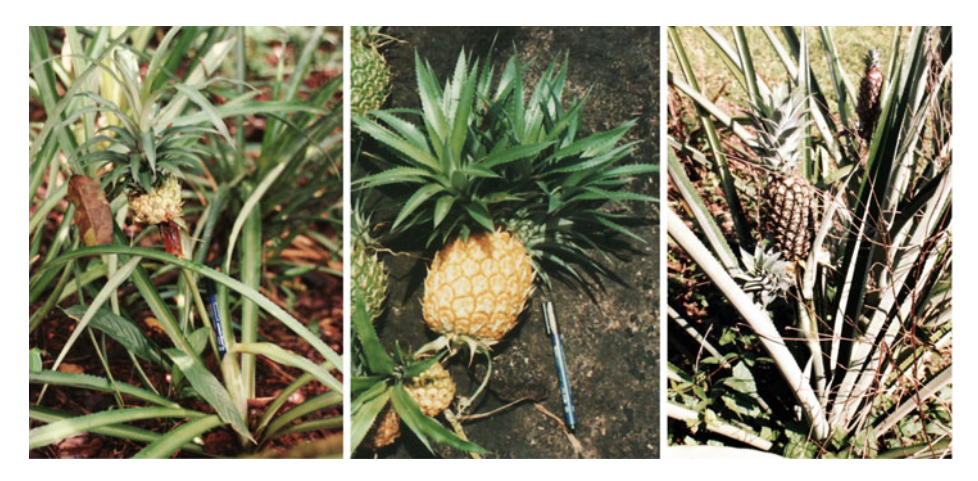
Fig. 2.3 Variation for Ananas comosus var. ananassoides in French Guiana: a small dwarf type from the rain forest; a fleshy, relatively large fruit from a wild population growing on a rock