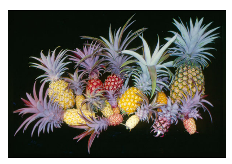
Fig. 2.8 Example of variation obtained through hybridization of the large-fruited A. comosus var. comosus ( upper right ) with small-fruited wild or primitive pineapples

The highest potential of hybrid breeding between botanical varieties lies in the transfer of resistance/ tolerance to major pests and diseases. Thus, clones of A. comosus var. ananassoides , A. comosus var. erectifolius , and A. macrodontes are thought to exhibit levels of resistance to the nematodes Rotylenchulus reniformis and Meloidogyne javanica , allowing very low levels of nematode reproduction (Ayala 1961;