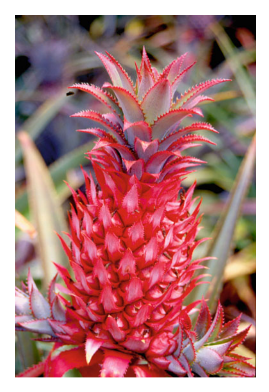
Fig. 2.7 The most common form of Ananas comosus var. bracteatus

A. comosus var. bracteatus is particular as this variety is an assemblage of two cultivated forms that show the same geographic distribution as A. macrodontes and that are morphologically and genetically intermediate between the two Ananas species (Fig. 2.7). The most common one, corresponding to A. bracteatus sensu Smith & Downs, is a cultigen that was cultivated as a living hedge and harvested for fiber and fruit juice, or for traditional medicine, in southern