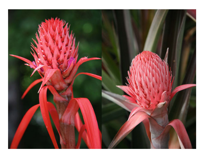
Fig. 2.9 Two smooth-leaved hybrids obtained from crosses between A. comosus var. bracteatus and A. comosus var. erectifolius ( left ), or a "piping" leaved A. comosus var. comosus

cultivar with A. macrodontes (right), both selected for the cutflower market